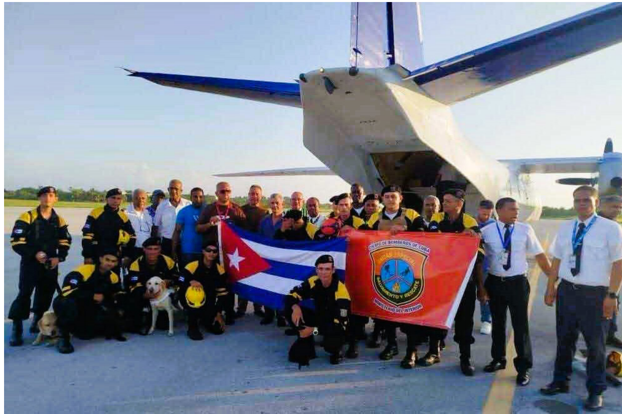
• Cuban medical team arrives in Caracas.

However, even as tons of concrete and dust were still being cleared away, Cuba made a decision that required no speeches: not to abandon Venezuela. On Sunday afternoon, the first contingent of Cuba's Special Search and Rescue Brigade landed. Along with the 13 specialists came