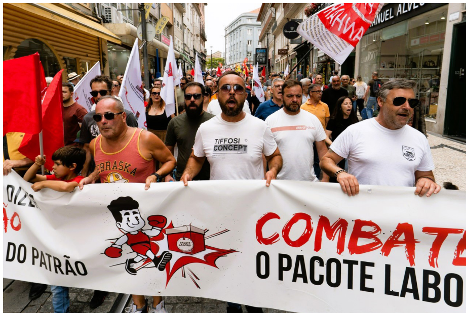
• Workers march through Lisbon during the June general strike.

But Portugal’s militant union federation, the General Confederation of Portuguese Workers (CGTP), had different ideas. They sprung into motion, and over 11 months they carried out several mass marches and two general strikes – one on 11 th December 2025