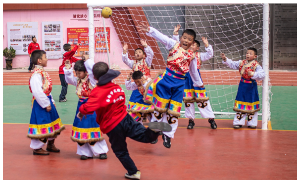
• Play-time at the Qamdo Experimental Primary School.

In Qamdo Experimental Primary School’s curriculum, millennia-old intangible cultural heritage resonates alongside cutting-edge technology.