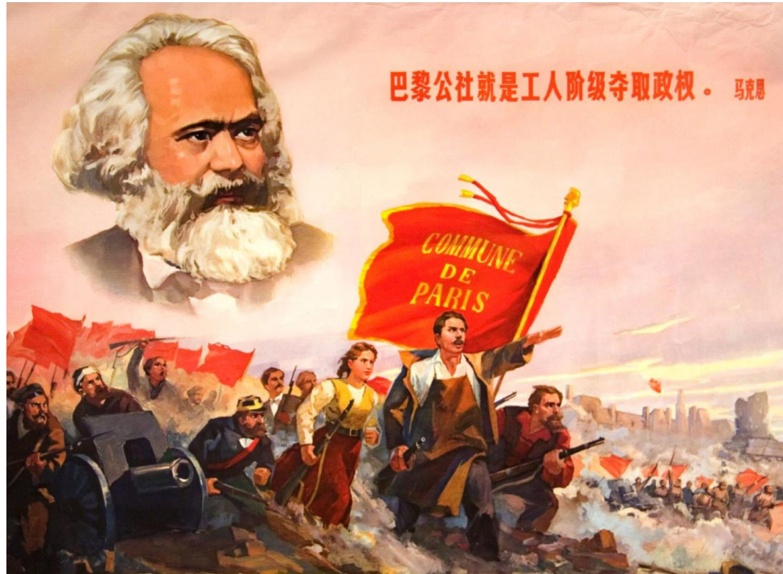
• Paris Commune 1871 – the first workers' state.

To fully understand the dictatorship of the proletariat it is important to be aware that it does not imply the use of force or threats against others. In Marx and Engel's days the term 'dictatorship' didn't mean autocratic one-man rule in the way we understand it today. They used the term to mean class rule. In the capitalist era we live under the dictatorship of the bourgeoisie. The dictatorship of the proletariat means the working class taking power to establish a new type of democracy. To organise the economy to benefit the former exploited classes. To raise political and social awareness of the masses. And to stimulate progressive cultural developments. This would see an end to identity politics, elevation of trivial diversions above matters of substance, the greed and corruption of lobby groups and the politics