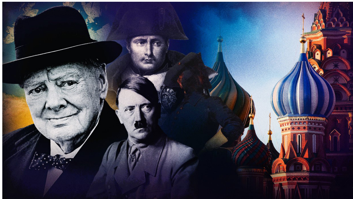
• Not the first time: Western Europe’s war on Russia is centuries old.

The USA and the Western Europeans have launched numerous aggressive actions against Russia since the latter began its special military