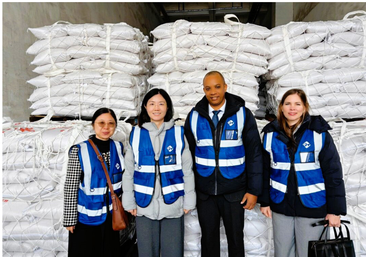
• Blockade-breaking Chinese rice for Cuba!

has delivered 30,000 tons of rice; furthermore, an additional 60,000 tons have been pledged, bringing the total volume of food aid to 90,000 tons – enough to feed one million people for a year.