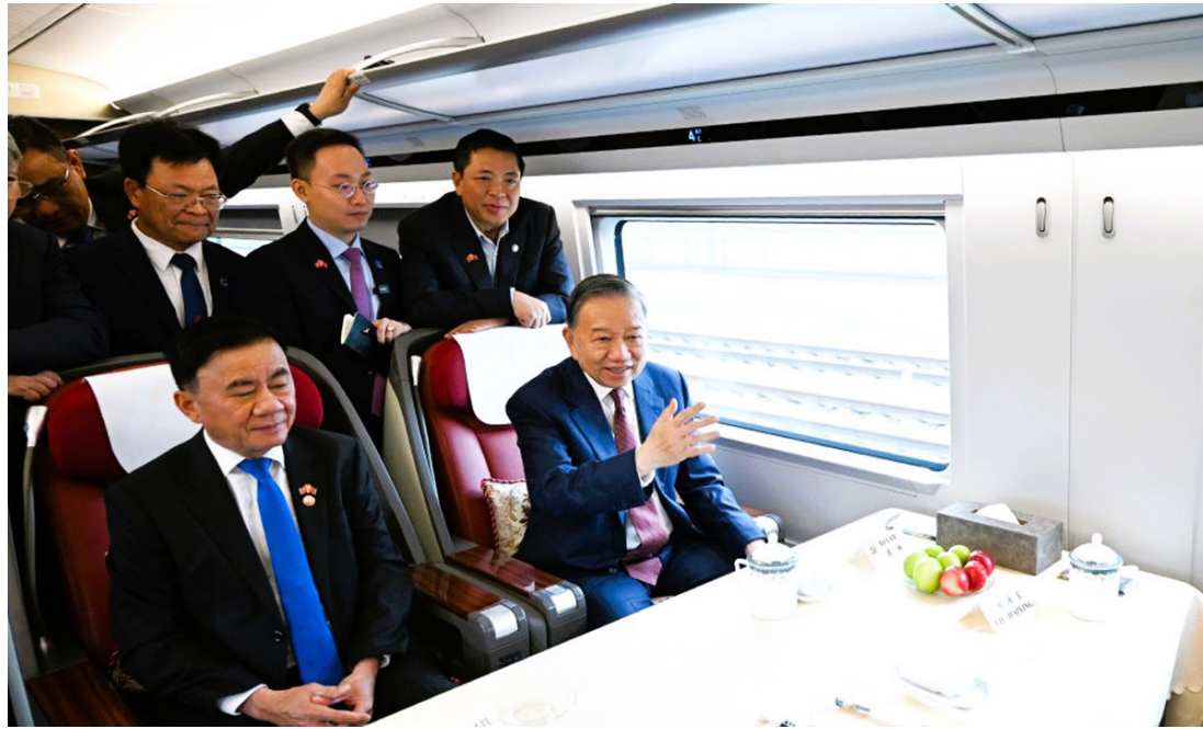
• Letting the train take the strain – Vietnamese leader To Lam travels south in a Chinese bullet train.

Twenty years ago or so high-speed rail was still an expensive and scarce luxury mainly confined to Western