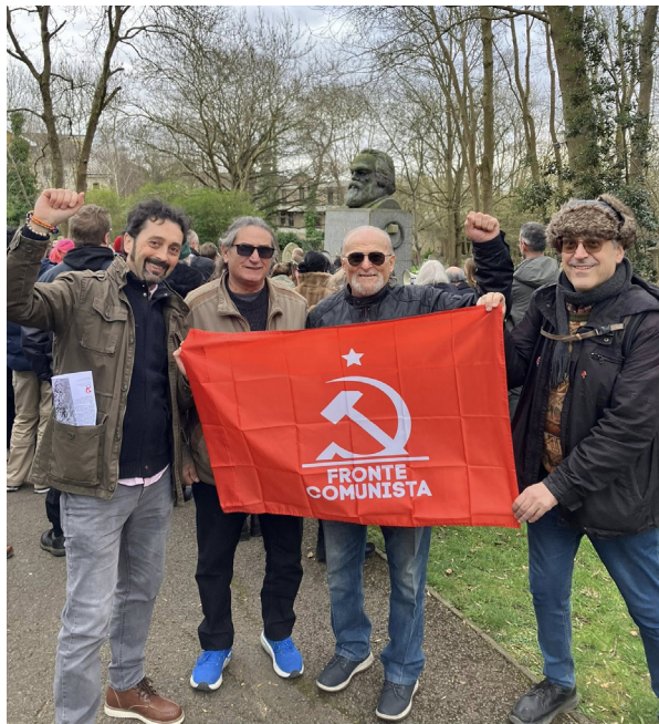
• Italian comrades at the oration.

Marx passed away in London at the age of 64 after a life-time of struggle to build the revolutionary movement. "Marx was before all else a revolutionist" Engels said. "His real mission in life was to contribute, in one way or another, to the overthrow of capitalist society and of the state institutions which it had brought into being, to