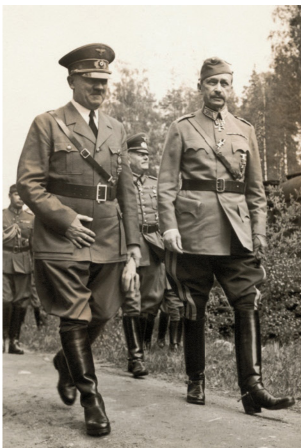
• Hitler meets the Finnish Commander-in-Chief, General Mannerheim in 1942.

When Finland failed to make significant military