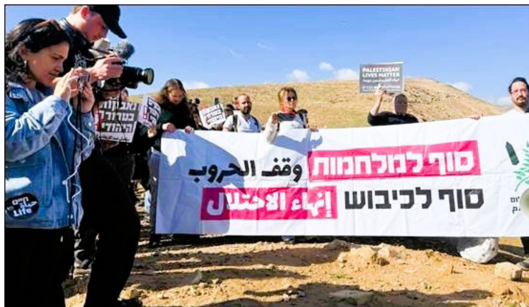
• "End the War, end Occupation", peace campaigners demonstrate in Israel.

The Global Sumud Flotilla says that it will send more than 100 boats carrying up to 1,000 activists, including medics and war crimes investigators, to Gaza in a "co-ordinated humanitarian intervention" for Gaza next month. Thousands more will be