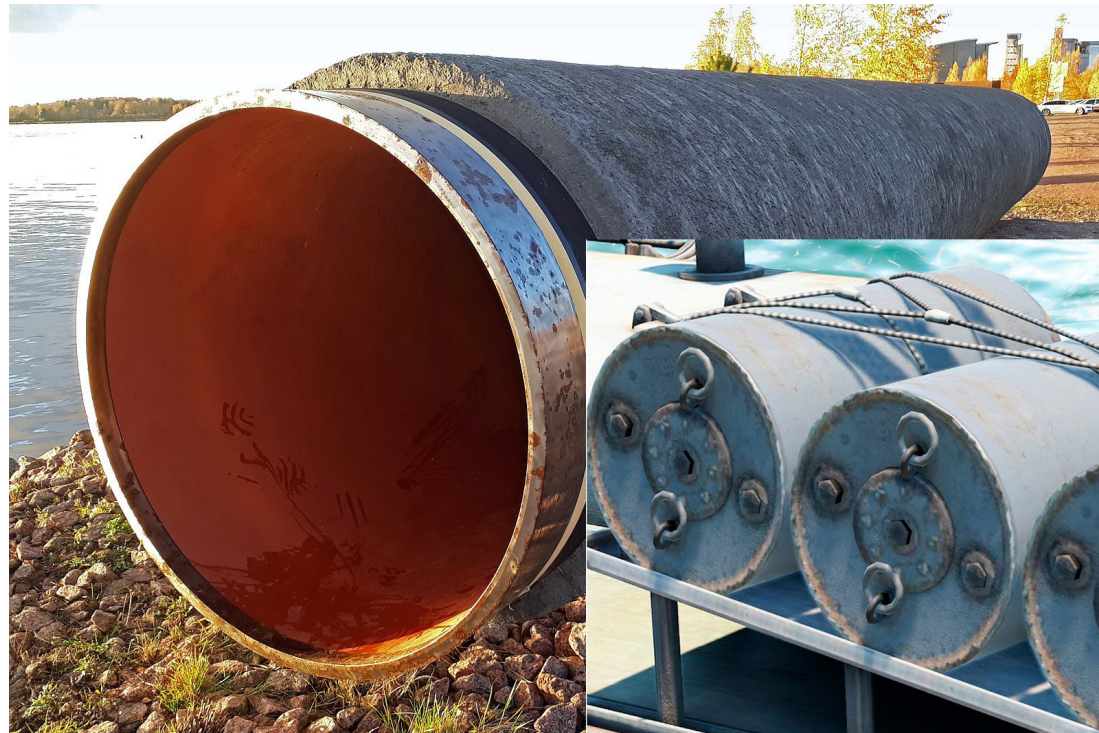
• Nord Stream pipe and typical naval depth charges.

Three years later, in August–September of 2025, the Shanghai Cooperation Organisation (SCO) summit was held in Tianjin, China. This 25 th meeting was the largest in the history of the SCO: more than 25 heads of state took part, as well as representatives of 10 global organisations, including the United Nations. One of the main outcomes of this Asian summit was the signing of a legally binding document on the construction of another large-scale gas pipeline project, the ‘Power of Siberia-2’. As part of the new construction, 50 billion cubic metres of high-quality natural gas will be supplied from Russia to China annually. Asian economic leaders