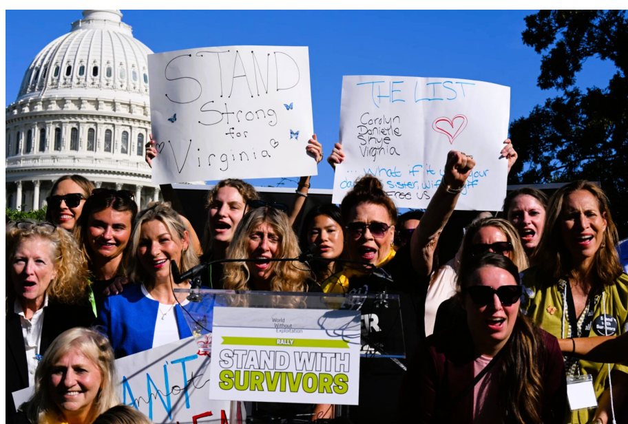
• Protest in Washington DC.

Prior to the bill being signed, victims of the horrific sexual abuse perpetrated by finance capitalist Epstein publicly demanded that all the related documents be released. If these courageous survivors – many under 18 when the abuse began – had not spoken up, this bill would not have become law. The bill mandating the release of the Epstein files is a victory for the