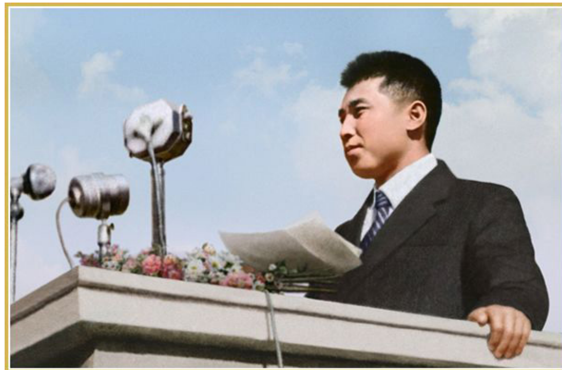
• Kim Il Sung addresses the crowd in Pyongyang after liberation.

Worse are those who claim that Juche is a form of 'ethno-nationalism' or a 'state