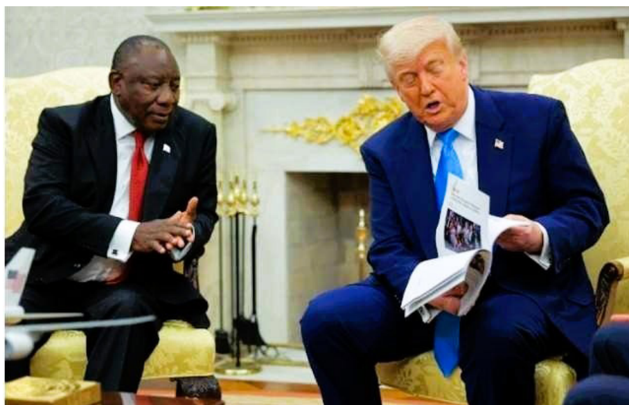
• Ramaphosa listening to Trump’s rant in the White House.