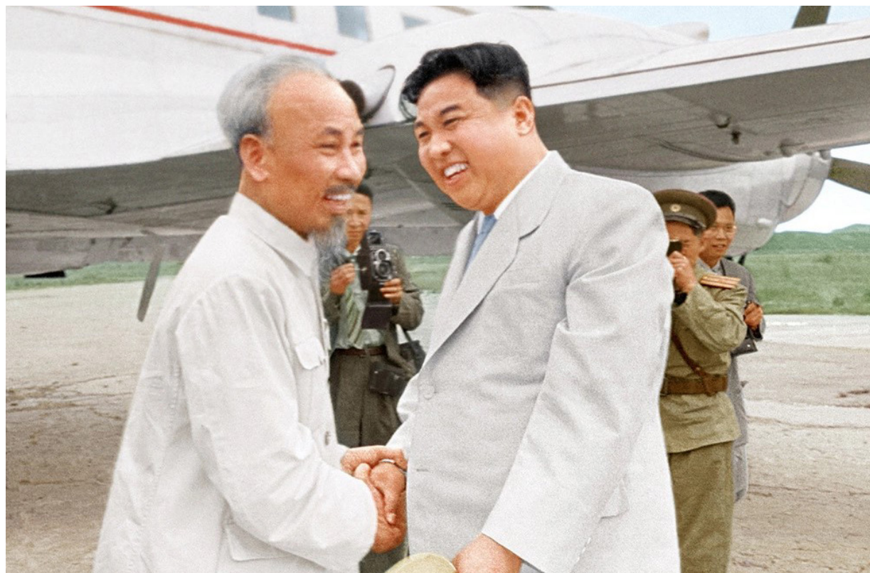
• Ho Chi Minh and Kim Il Sung.

The DPRK put self-reliance into effect in many fields. It achieved self-sufficiency in grain