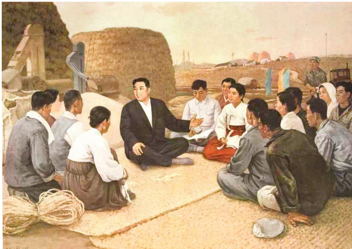
• Kim Il Sung with villagers.

Many years later, on 17 th September 1972, President Kim Il Sung explained to journalists of the Mainichi Shimbun , one of Japan’s major daily newspapers, that: “In a nutshell, the idea of Juche means that the masters of the revolution and the work of construction are the masses of the people and that they are also the motive force of the revolution and the work of construction. In other words, one is responsi-