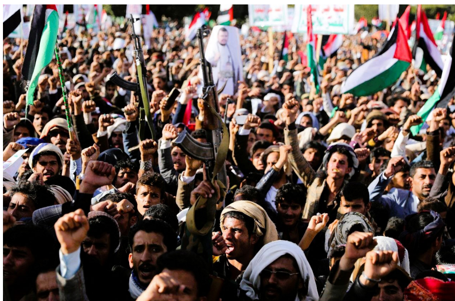
• Yemenis rally for Palestine in Sanaa.

"They say they will not be blowing up ships anymore, and that was the