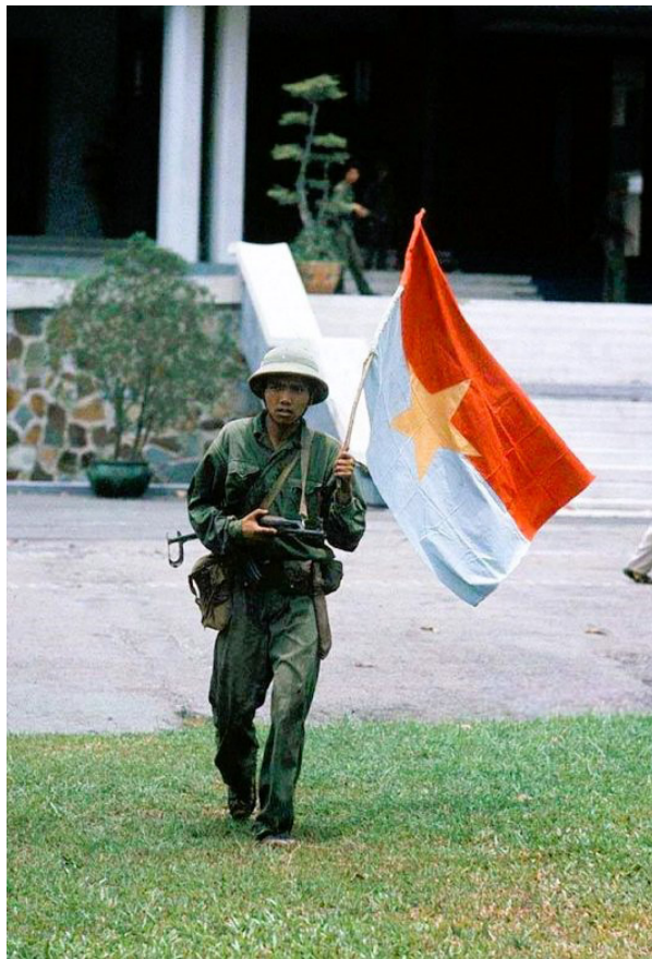
• Saigon freed as Americans flee.