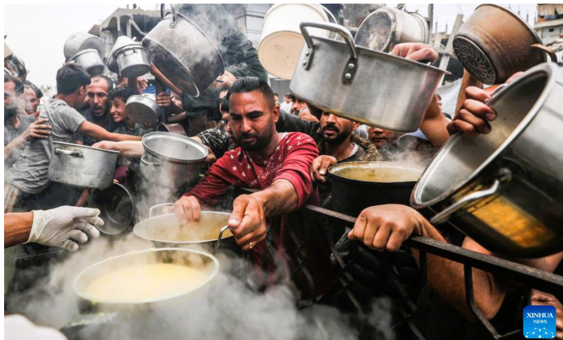
• Free food distribution in Gaza.

The Freedom Flotilla Coalition has asked the Maltese government to allow their ship to enter Maltese waters to repair the damage and continue its journey towards Gaza. But the Maltese Prime Minister, Robert Abella, says that unless his government is allowed to inspect the Conscience , it will not allow it to dock. “As soon as we establish the fact that the ship is indeed carrying humanitarian aid for Gaza, we will take care of the repairs. We need to be in control, especially when the ship has no