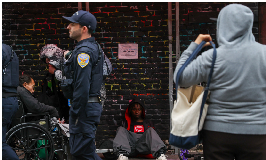
• The 'American Dream' on the streets of San Francisco.

All empires rise and ultimately fall unless they can evolve and adapt. The bizarre and alarming economic events of the last month clearly show that for many Americans their dream has turned into a nightmare. For decades the USA has run a continuous trade deficit and sold its debt to others as a safe haven for investment. The US national debt now exceeds $36.7 trillion dollars and the associated interest charges are crippling its economy. Once a mighty, powerful industrial force, American industry is no longer able to compete in many sectors with overseas competition. For this it blames others, whom it now intends to punish. The result is an international trade war and a full economic war against People's China, its major competitor. The enormous damage done to the US reputation will be long lasting and the threat of a world recession is increased. Washington is