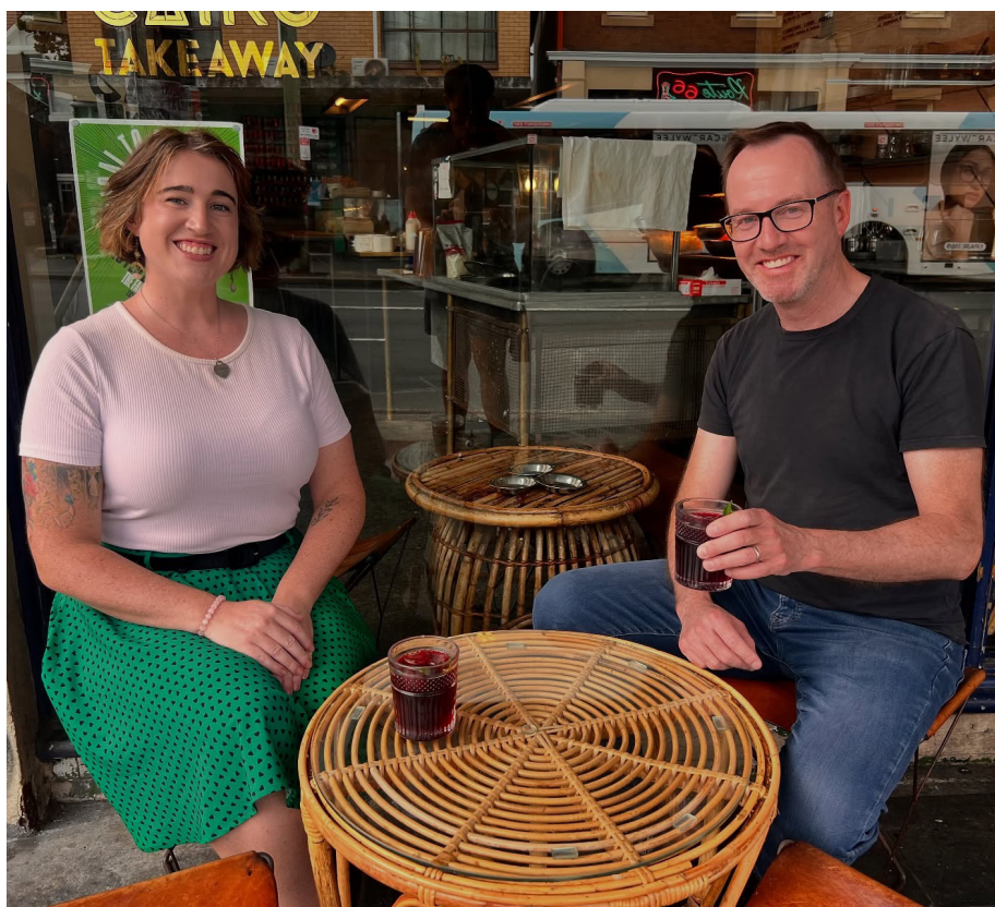
• The CairoTakeAway team!