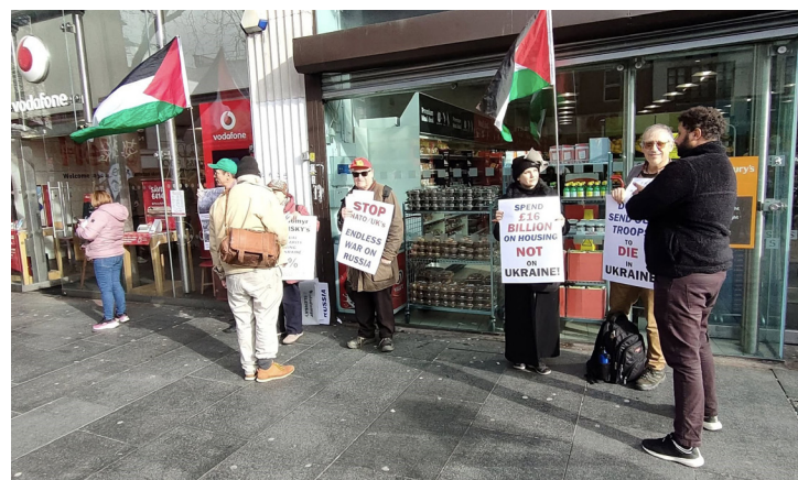
Look around you, you can see the devastation here!"

These are some of the comments we had from the local people: "Why are we giving all that money to that guy in Ukraine (Zelensky)? He's got houses all over the world... We need that money for ordinary people here!... Fuck NATO! They are killing the whole world!" and "Spend money on people here, not on Ukraine,