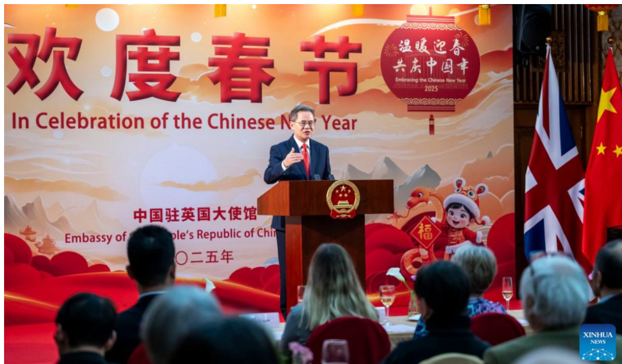
• Chinese ambassador Zheng Zeguang welcomes the guests at the reception.

At the event the Chinese Ambassador Zheng Zeguang recounted the rescue that stands as a testament to the time when