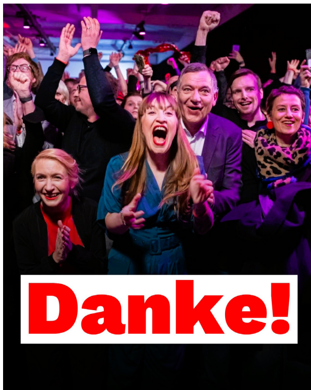
• The left-social democratic Linke thanks its supporters!

After a late surge in support, Die Linke (The Left) scored nearly nine per cent, giving it dozens of seats. It dominated in the capital, Berlin, and gained 30,000 new members. During the election, its campaign workers knocked on over 300,000 doors. A smaller breakaway group, the Sahra Wagenknecht Alliance (BSW), scored nearly two-and-a-half million votes but will likely not win any seats in the parliament.