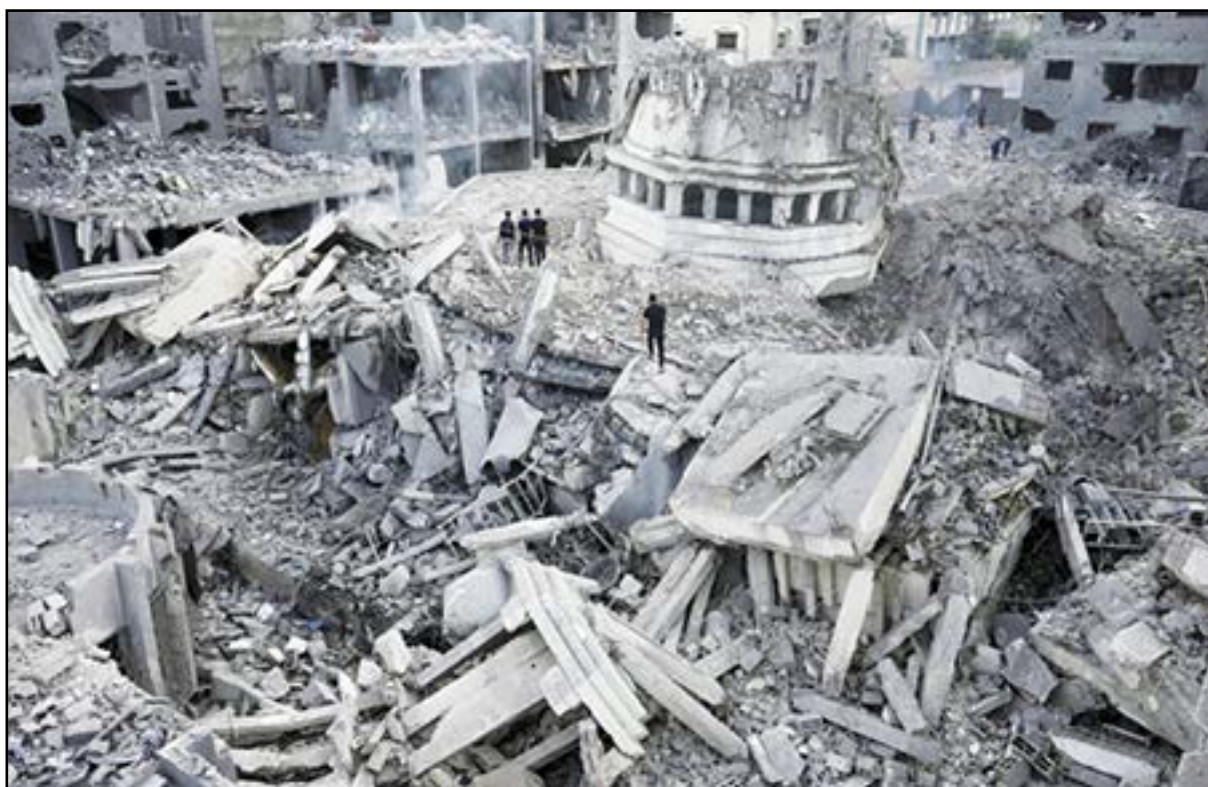
Gaza in ruins.

Housing suffered the most during Israel's 15-month-long attack on the territory, with the report writers estimat-