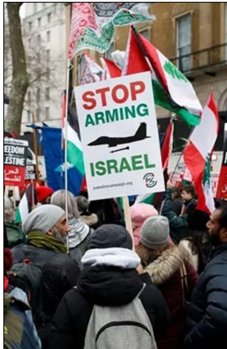
London protest for Palestine and Gaza.

But the European Union will only be involved in the talks if the lifting of sanc-