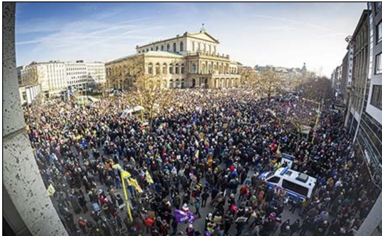
Anti fascist protest in Munich.

What has been happening in Germany is not an isolated phenomenon. Economic crisis is driving people to look