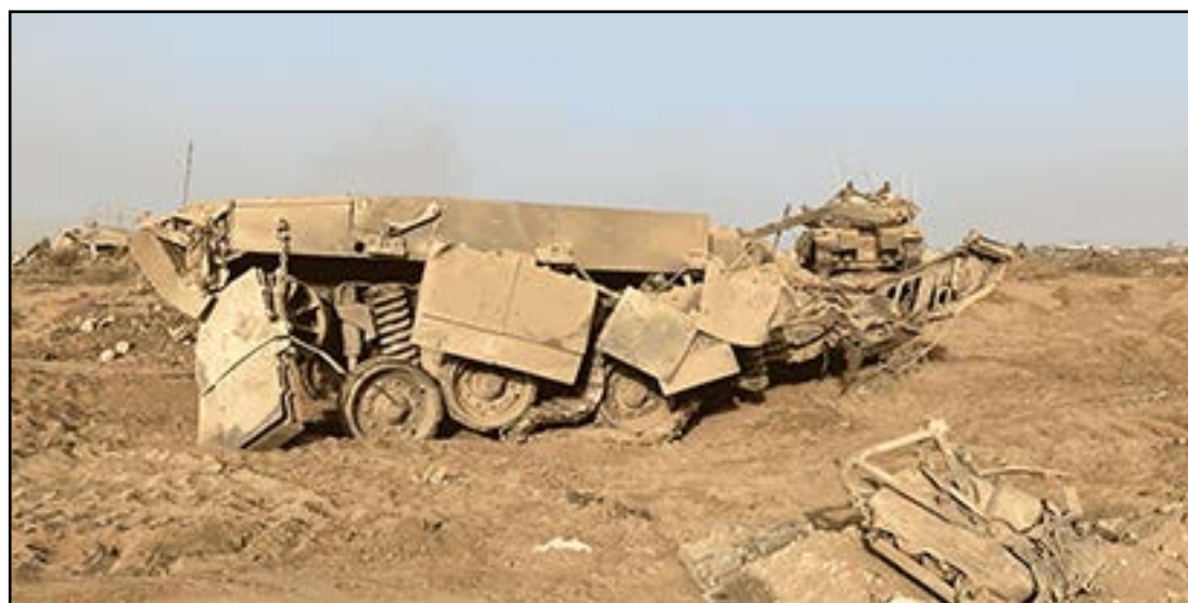
Israeli tanks destroyed by the Palestinian resistance in Gaza.

Social media was flooded with Gazans expressing a mix of emotions, though they were mostly defiant, expressing their resolve not just in political terms