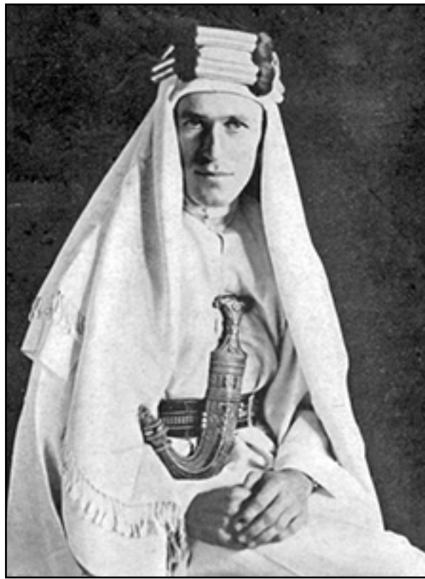
English officer TE Lawence fought with the Arabs against the Turkish empire in WWI.

I always wondered why Hamas got help from the Shia Muslim resistance — from Iran, from Hezbollah, but the Sunni countries were acting like traitors. The Emiratis, Saudi Arabia, Qatar, Jordan — they are Sun-