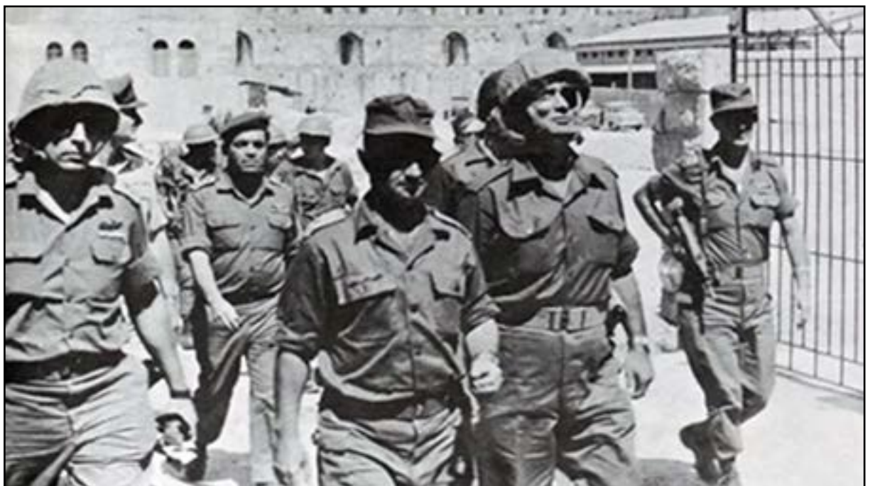
Israeli commanders in East Jerusalem, 1967.

about its new narrative. The Israeli government talks about the idea of the greater Israel. Israel has been advancing at this point a lot lately. The Israelis invade Lebanon, they have crushed Hezbollah and have their eye on Syria. Israel has a very big ambition now. The Israeli narrative has changed a lot lately. They would