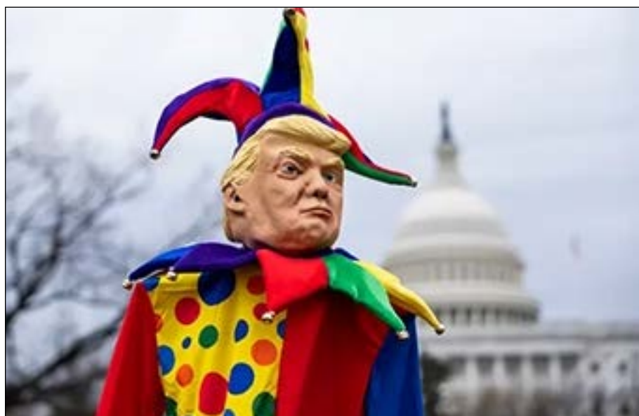
People in the US show what they think of Trump.

back by American and South African involvement in the war against the MPLA freedom-fighters in Angola. But the historic victory of the MPLA-Cuban forces at the battle of Cuito Cuanavale in March 1988 finally opened the path for Namibia’s independence the following year. Nujoma served as the country’s first president until November 2007. However it was Namibia’s great misfortune to gain its freedom just as socialism was reversed in the Soviet-led bloc, limiting the prospects for socialist-oriented development beneficial to the working people. Sam Nujoma, as he was known, was a charismatic and inspiring leader, with great charm and a characteristic smile. He will be forever remembered as a great socialist, freedom fighter, a Pan Africanist and supporter of the Non-Aligned Movement.