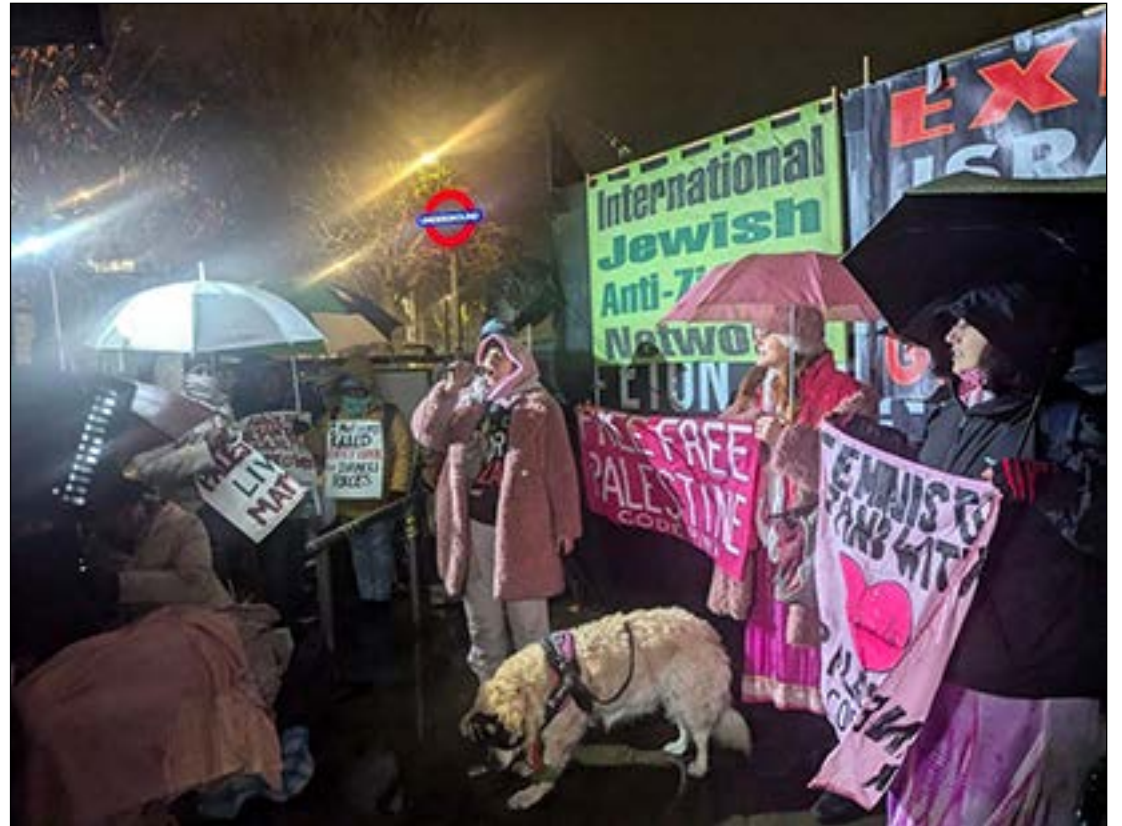
Palestine solidarity campaigners picketing the Israeli ambassador's residence in north London last week.

turn of US nuclear weapons to Britain, despite growing evidence that they are on their way.