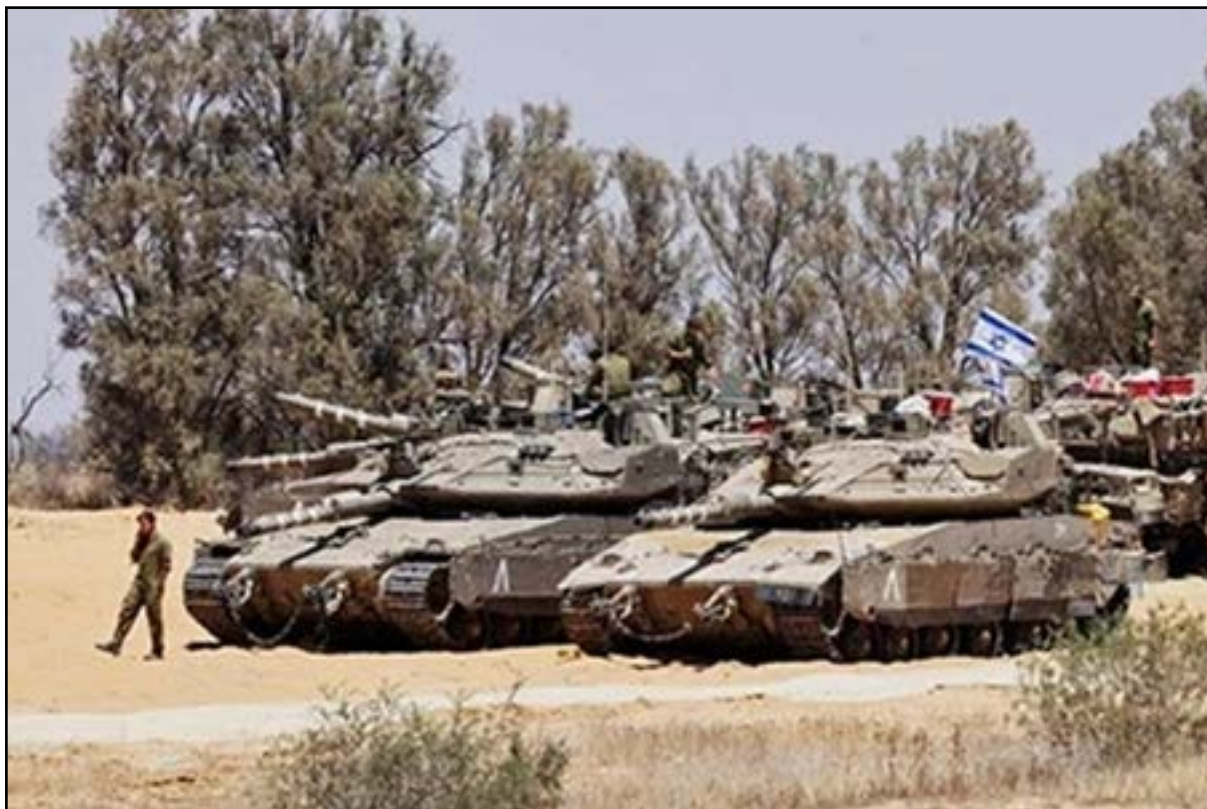
Israeli tanks on the border of Gaza in the latest conflict.

This is why we say the Palestine narrative in this new era is to keep the momentum that has emerged in the world after the October events and in view of the genocide campaign against Palestine.