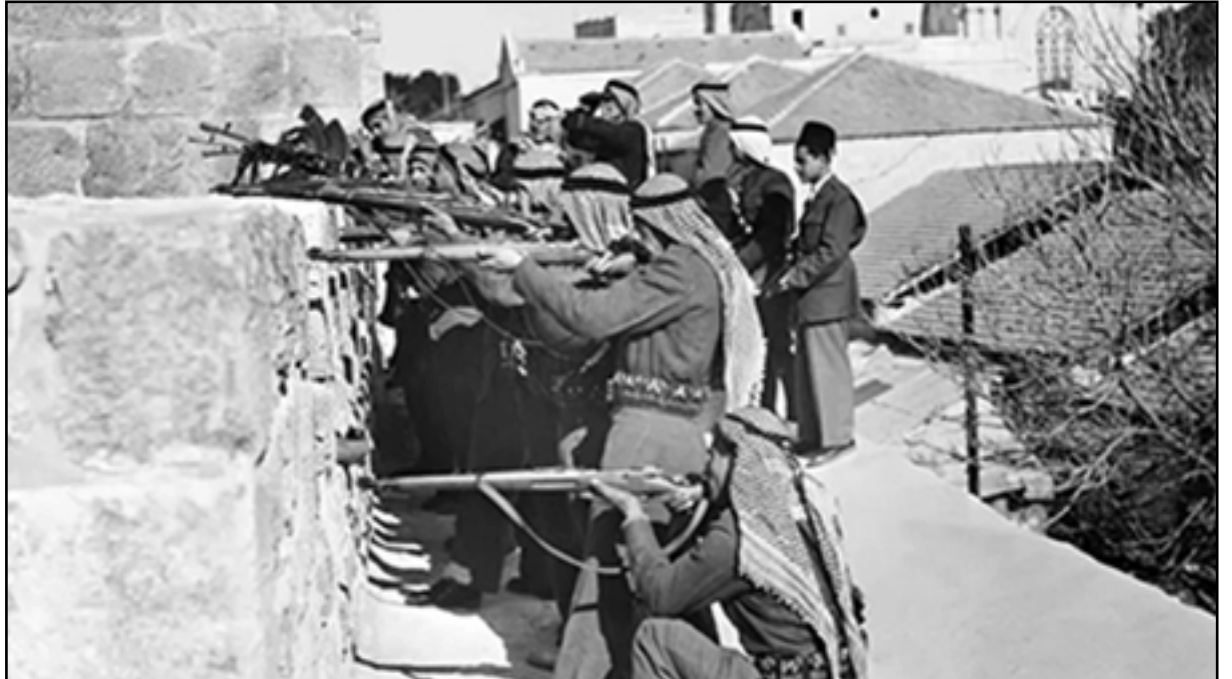
Arab forces face Jewish terrorists, 1948.

Look what they did in Syria. They toppled the president and forced him to