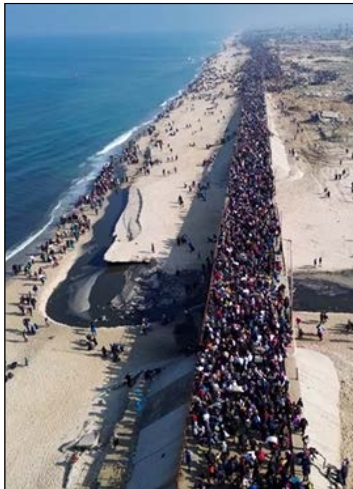
Palestinians walking back to northern Gaza.

In Israel demonstrations in support of the truce and an end to the war are continuing to be held in Tel Aviv and dozens of other towns and cities across the country. The protests have been fired by the recent admission of Israel’s heavy losses in the Gaza war. General Eyal Zamir, the new head of the Israeli armed forces, said that Israeli casualties were much higher than