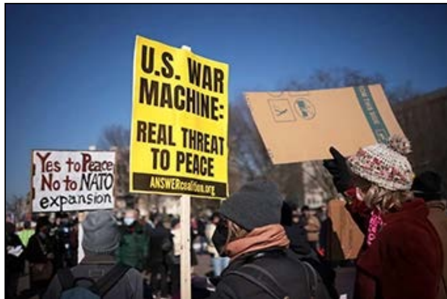
Anti war protest in US.

Boris Pistorius, Germany's defence chief, said that the Trump initiative was "regrettable" arguing