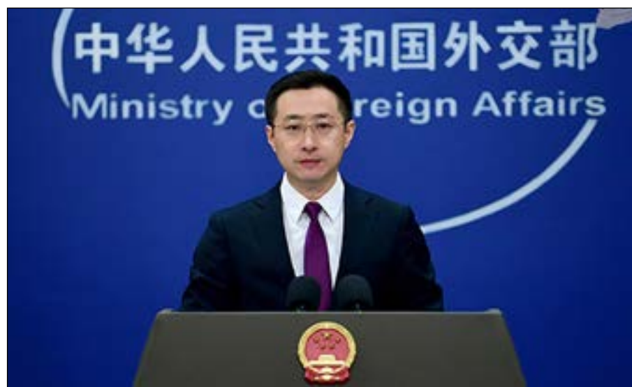
Lin Jian, Chinese Foreign Ministry spokesperson -- no winner in a trade war.

operate below the Federal Aviation Administration's recommended staffing levels". Moreover "persistent staff shortages and an underinvestment in safety systems have led to an alarming number of close calls between aircraft".