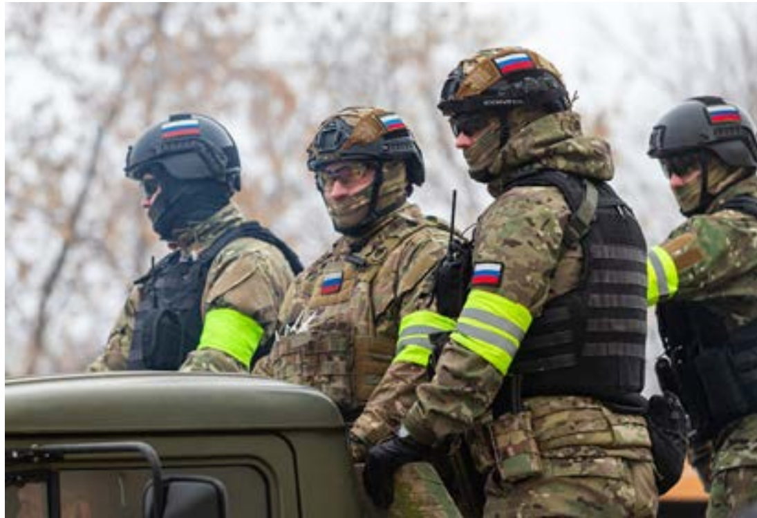
Russian troops move forward.

At the moment, the DPR is not a participant in the negotiation process, as it was in 2014-2020. Today we are a legitimate region of the Russian Federation, according to the Constitution. Any negotiations on war and peace should be conducted by Russian President Vladimir Putin and the Government of our common country. But, in our deep conviction,