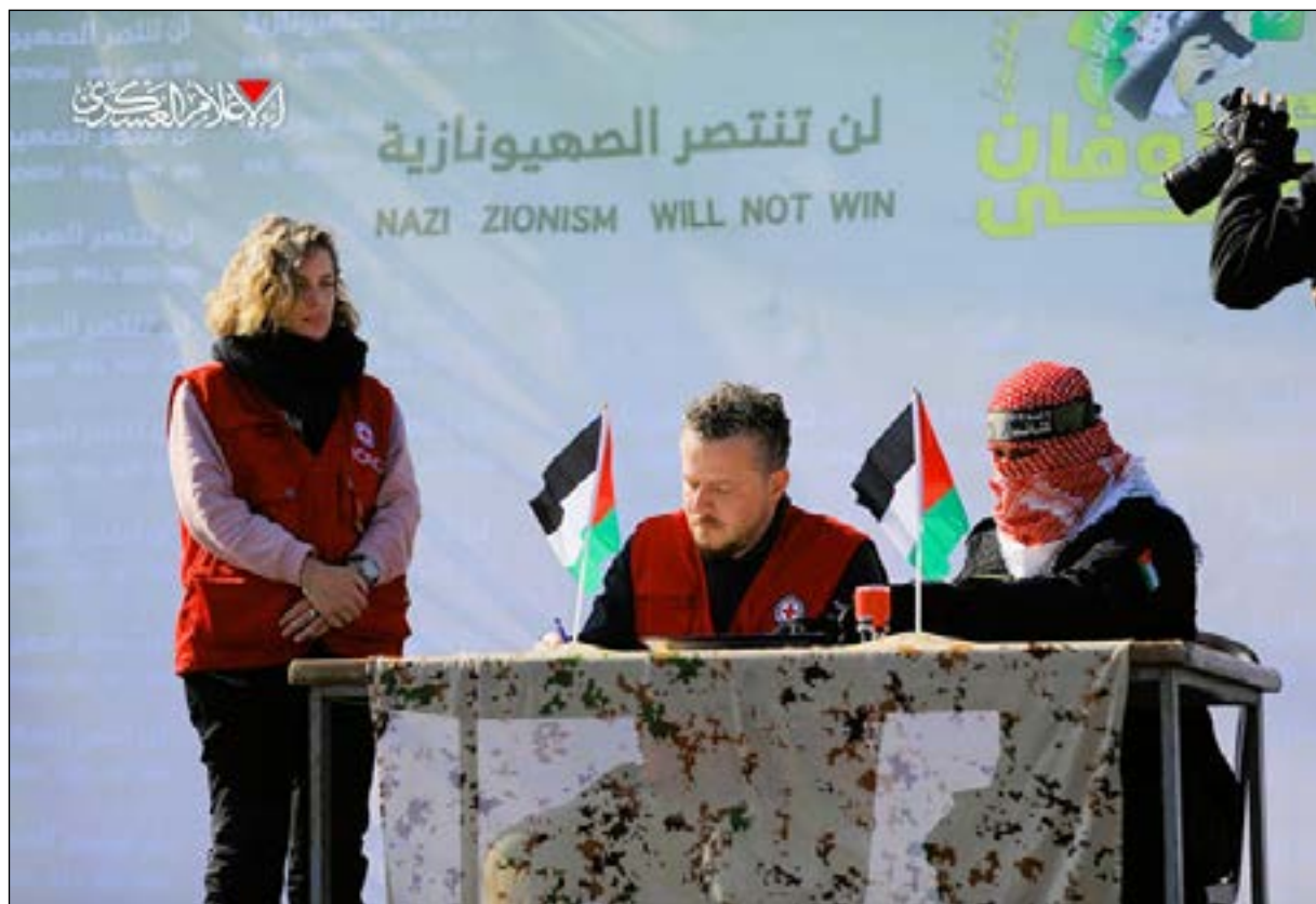
An Israeli prisoner is handed over.

“dangerous deal” that compromises Israel’s “national security”.