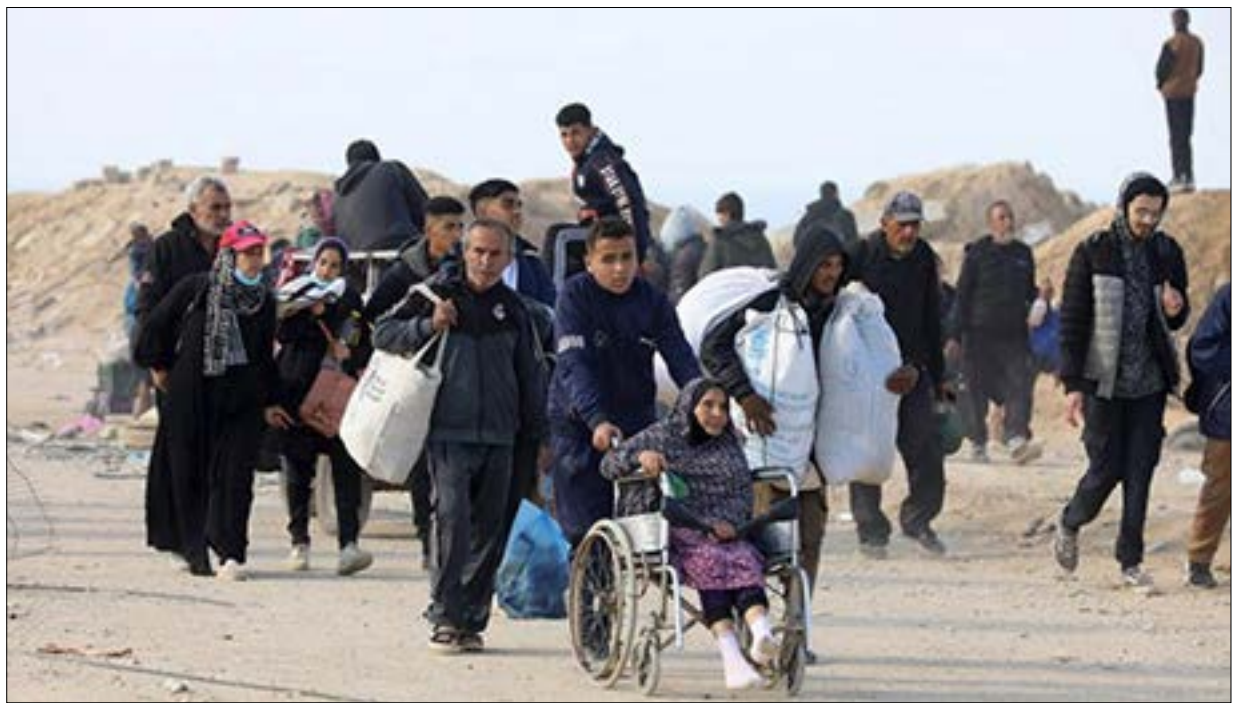
Returning to Gaza.

The plan to deport Palestinians is presented with high seriousness, and preparations for it are taking place behind the scenes to move the residents of Gaza to Egypt and from the West Bank to Jordan. This plan is based on communications between Donald Trump and his counterparts, Egyptian President Abdel Fattah el-Sisi, King Abdullah of Jordan, as well as secret communications with other countries, such as Albania and Indonesia as well as some members of the Or-