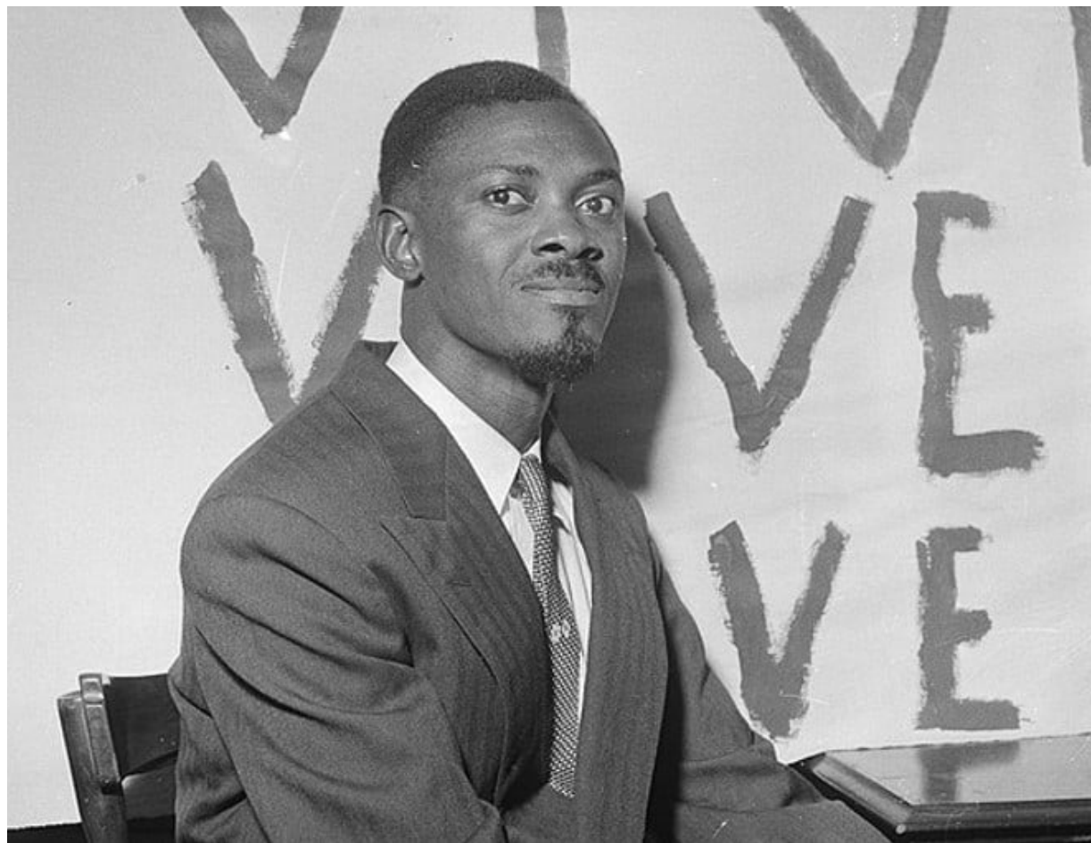
• Patrice Lumumba -- murdered by imperialism.

The meticulously edited film examines the coup d'état and the deep involvement of American officials, including the Dulles brothers, Adlai Stevenson and President Eisenhower, who were all tied in with the Belgian elite who profited from the virtual slave labour that extracted oil, rubber and ivory from the Katanga province, the main source of the