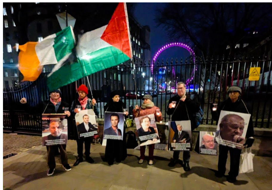
• Free Ukrainian political prisoners! IUAFS New Year protest in Whitehall last week.

Comrade communists and anti-fascists of the USA, we appeal to you for help. We communists of Ukraine ask you to help us and support us. Our lives and the lives of our comrades depend on it. We ask you to come out to actions in our support at the embassy and consulates of Ukraine in the USA. Be brave and honest! Be real communists and anti-fascists! We are communists, we cannot lose! And if we lose, then we are not communists!