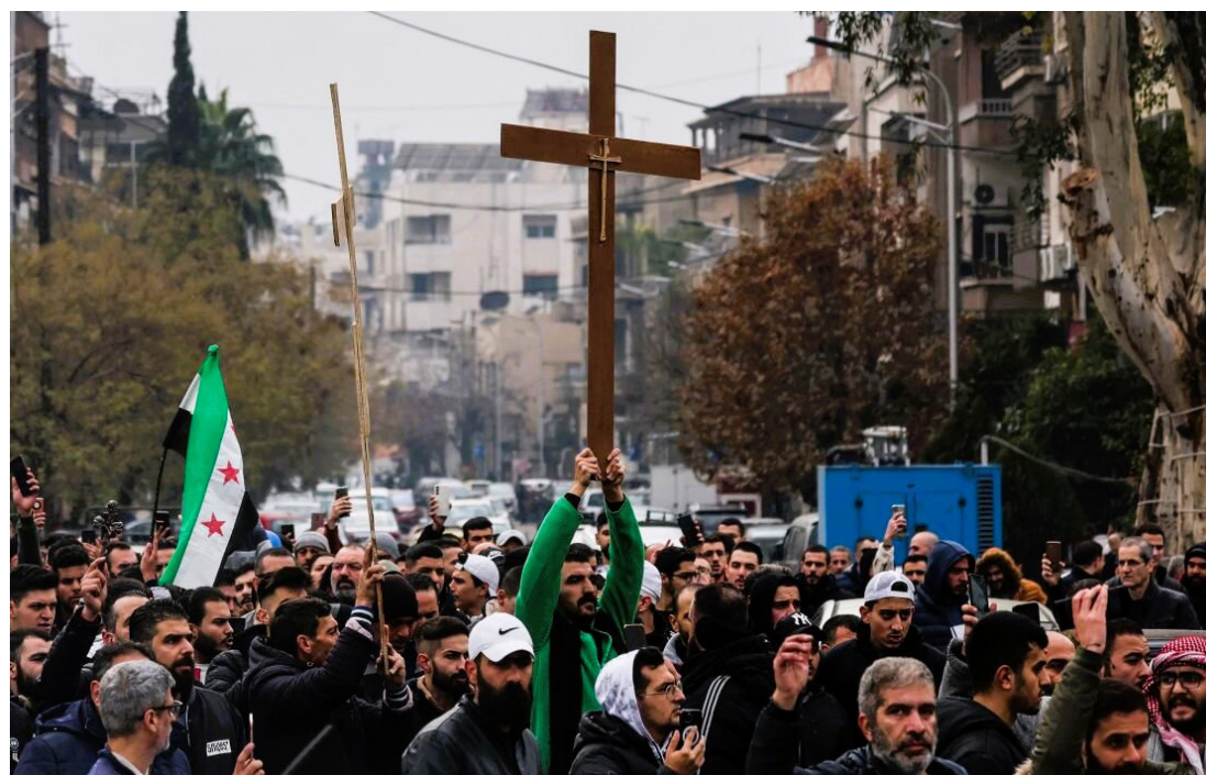
• Syrian Christians demonstrate against sectarian attacks.

On the diplomatic front, the new Syrian regime is striving for international recognition. The German and French foreign ministers have already held talks with Syria’s de facto leader, Ahmed al-Sharaa, also known as Abu Muhammed al-Jolani, in Damascus. Their first demand is the closure of the Russian bases on Syrian soil while Germany’s Foreign Minister Annalena Baerbock says that Europe would support Syria’s “transitional government” if the political talks include all ethnic and religious groups in the country. Easier said than done.