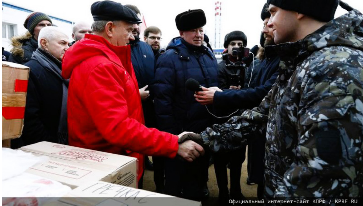
• Communist leader Gennady Zyuganov delivers humanitarian aid to the Donbas.

Look, our American comrades, at the “de-