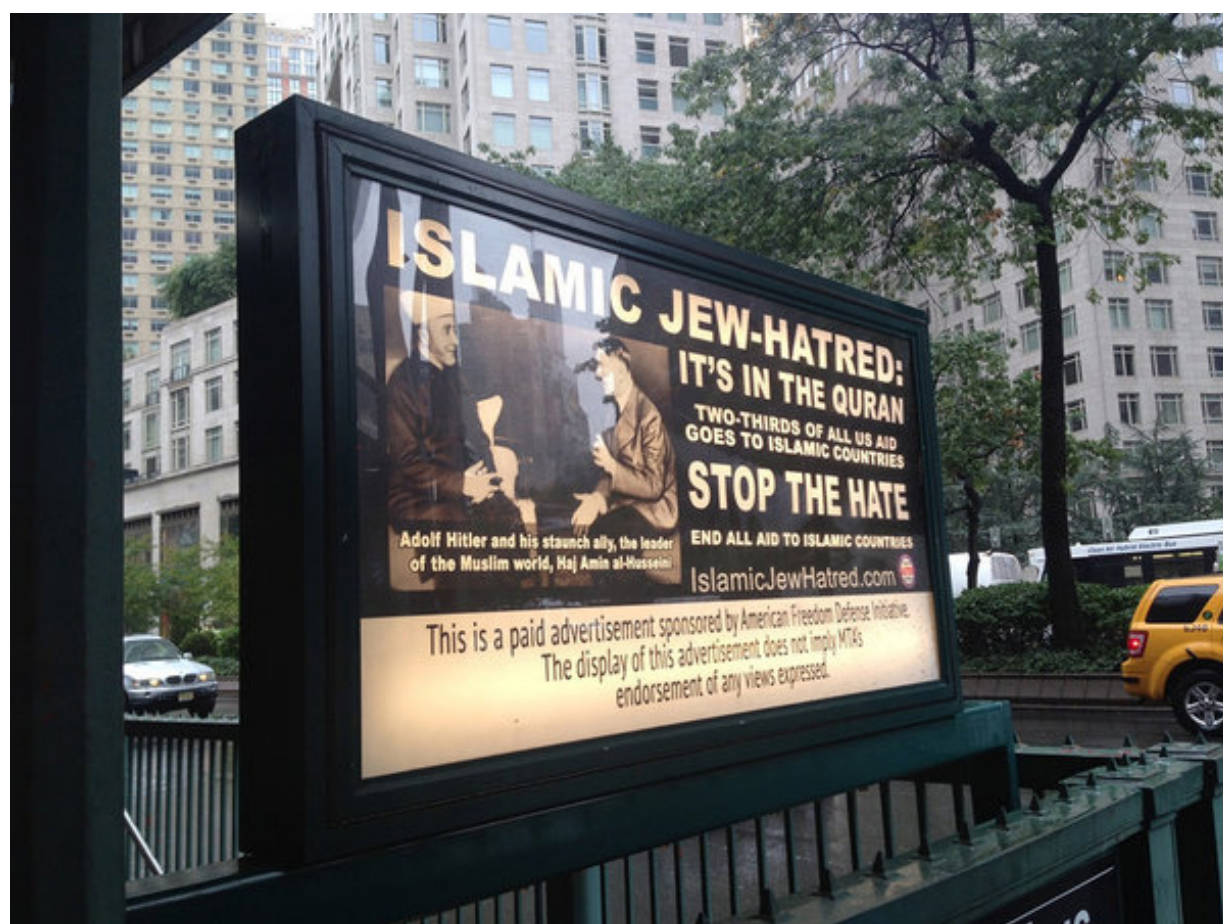
• Islamophobia: the hate campaign in the USA.

education, should be so susceptible to fear and paranoia.