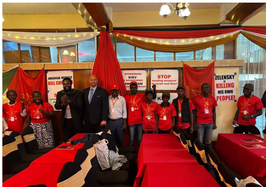
• Kenyan communists demonstrated their solidarity with Ukrainian anti-fascists at their 2 nd Congress in Nairobi this month. They declared their solidarity with the democrats and anti-fascists in Ukraine and the Palestinian people resisting Zionist aggression.