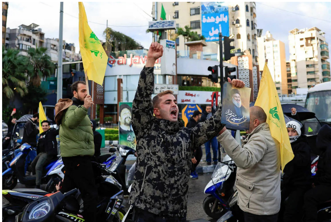
• Hezbollah supporters welcoming the news

Now the genocidal war in Gaza must end. The Palestinian resistance movement Hamas that runs the Gaza Strip says it's "committed to co-operating with any effort to reach a ceasefire in Gaza". Hamas says an agreement must end the war, pull Israeli forces out of Gaza, return displaced Palestinians to their