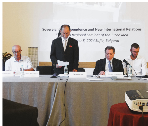
• At the conference.