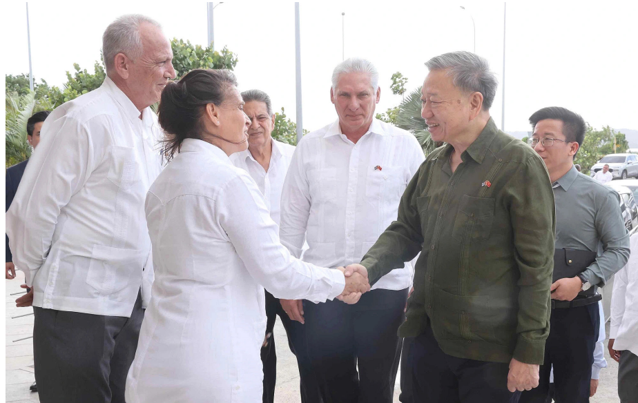
• Vietnamese leader To Lam and Cuban President, Miguel Diaz Canel Bermudez at the Mariel Special Development Zone.

Solidarity is a pillar of these relations, which have deepened, withstood the tests of time,