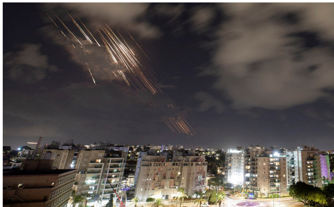
• Iranian missiles rain down on Israel Minister Abbas Araghchi said the Iranian armed forces had "solely

Netanyahu said Israel's soldiers have fought with "incredible courage and with heroic sacrifice" for the past 11 months. "And I have another message