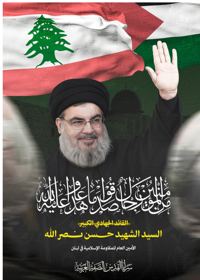
• Hassan Nasrallah 1960–2024.

Resistance is an idea and a philosophy, and the martyr Nasrallah is its memory and its history. He will never become a mere legend; rather, he will remain a guiding approach that produces a reality, centred on resistance, with pride as its essence, dignity as its compass, and liberation as its goal. Across generations, the martyr Hassan Nasrallah will be the beacon of resistance.