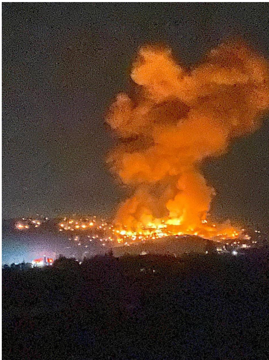
• Zionist terror bombing of Beirut.