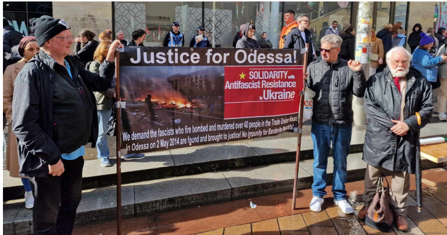
• solidarity in Glasgow.

The London protest opposite the Prime Minister's official residence in Downing Street came under sustained abuse