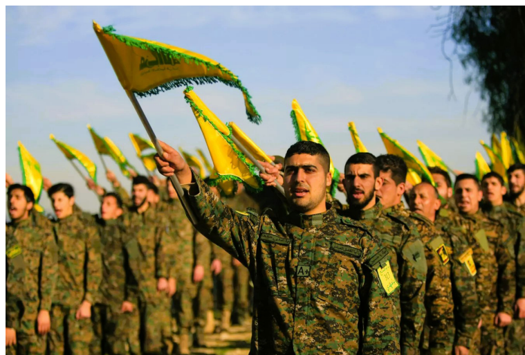
• Hezbollah ready to fight!

Last weekend, some 150,000 people demonstrated against Benjamin Netanyahu in Tel Aviv amid growing fears that his hard-line Zionist coalition is poised to open up a new front against the Arabs in Lebanon. Meanwhile the rift between Netanyahu and his top army leadership is deepening following the dissolution