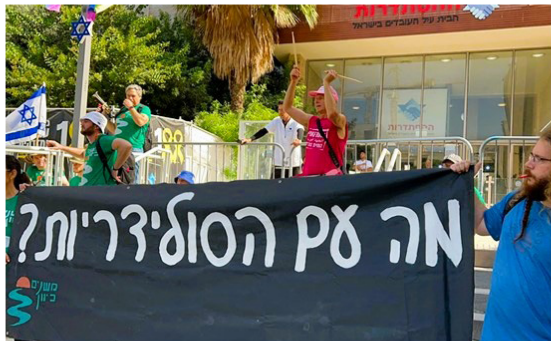
• Calling for a general strike to force new Israeli elections outside the Histadrut labour federation HQ in Tel Aviv.

organisation Nifgashim, over 10,000 Israeli reserve soldiers are now in some kind of mental therapy after their stint in Gaza. A growing number of them have attempted or actually have committed suicide when they returned home, causing a crisis of disillusionment within the Israeli army.