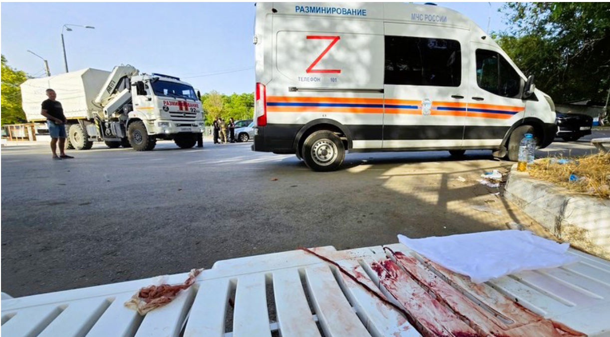
• Sevastopol’s bomb disposal units in action after the attack.