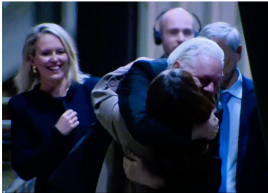
• Julian Assange: free at last!