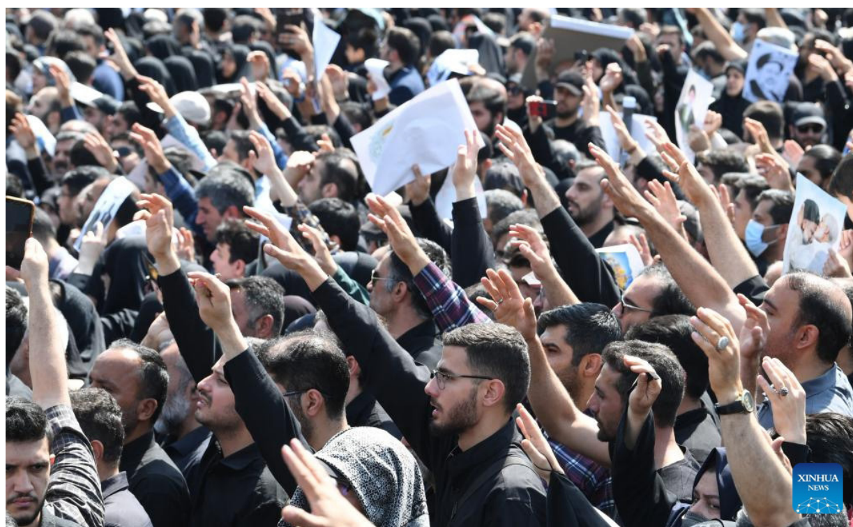
• Iranians mourn the loss of their leader.

Furthermore, the study concludes, Israel's attacks on Gaza hospitals follow a "consistent pattern" with attacks on the surrounding area, direct targeting, siege and occupation. These notes mean that everything indicates that the direct attack on the hospital, with almost 500 dead according to the Gaza Ministry of Health, was by Israel, and nothing indicates that it was the Palestinians themselves. Therefore, Joel Pinheiro da Fon-