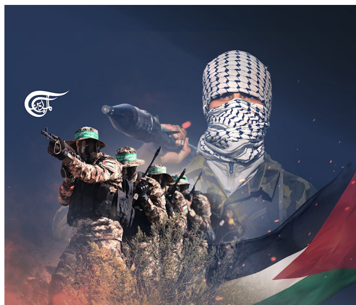
• Palestine -- there is only one road.

Five Arab countries – Egypt, Qatar, Jordan, Saudi Arabia and the United Arab Emirates – are supporting the Biden initiative and the Palestinian resistance movements have also responded positively to the proposals. And hundreds of thousands of Israelis have taken to the streets in support of a truce that would free the scores of Israelis held by the Palestinian resistance.