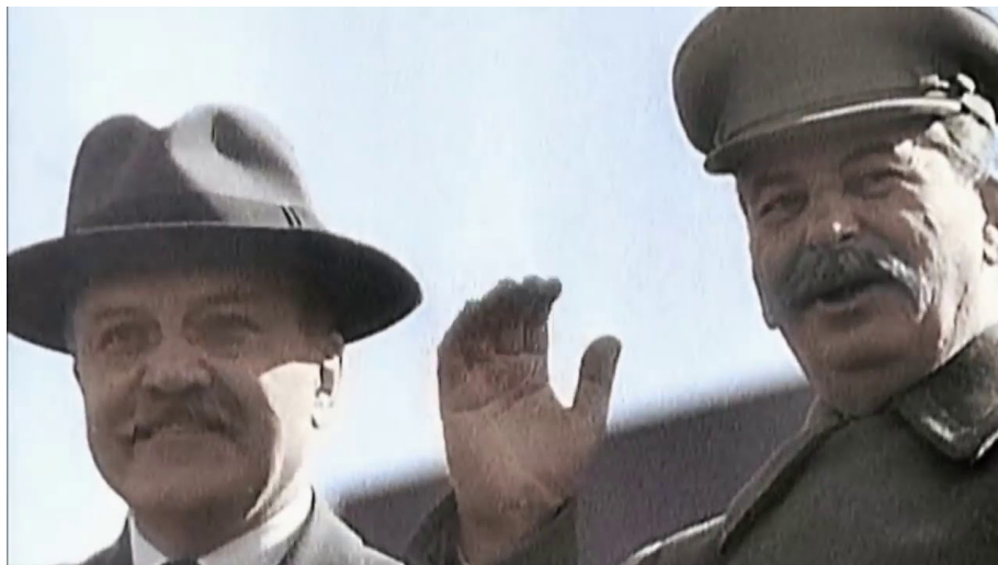
• Molotov and Stalin.

5) The Molotov-Ribbentrop non-aggression Pact did not include any "Secret Protocol" for the partition of Poland. On the contrary, the 1938 Munich Agreement actually led to the partition of Czechoslovakia. As it happened, Poland had participated actively in the allied imperialist attack launched against the newly founded Soviet state in 1918. With the Treaty of Brest-Litovsk on 3 rd March 1918, the Bolshevik leadership renounced Czarist claims to Poland. But the Polish government kept under its control a number of areas in the