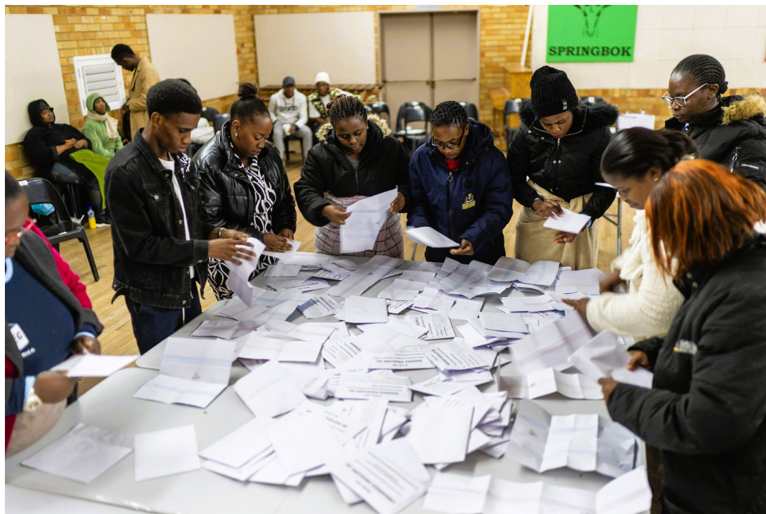
• Counting the votes in Johannesburg.