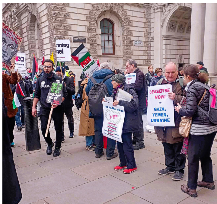
• International Ukraine Anti-Fascist Solidarity movement supporters at a Palestinian march in London.

It goes on: "A senior Ukrainian official said Zelensky has grown more 'emotional and nervous' over the situation on the battlefield and what they say the