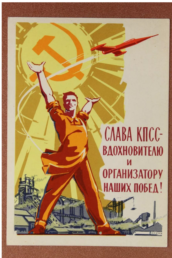
• Reaching for the stars in Soviet days!