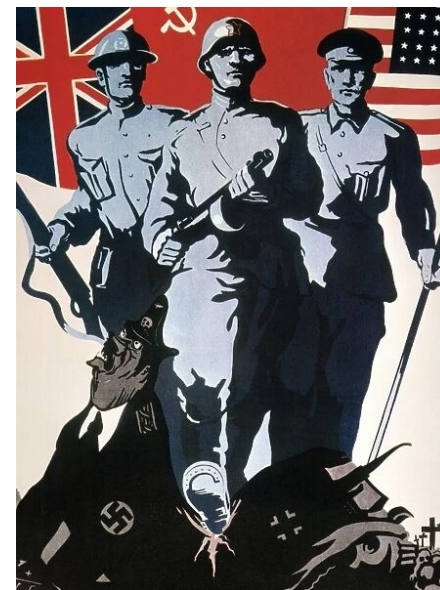
• A united front against the Nazis.