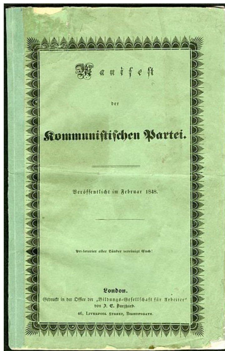
• The first edition of the Manifesto .

in France, it must be smashed and replaced by new organs of working class power.