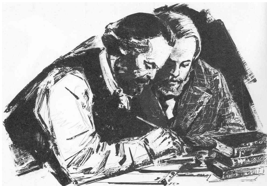
• Marx and Engels. Marx and Engels.

But Marx insists on what Mao Zedong would later refer to as "independence and initiative in the united front". The working class must be independently organised and prepared to resist the reactionary turn of the bourgeois class forces following the bourgeois democratic stage, where they will attempt to consolidate their power at the expense of the working class. Thus, in order to be prepared to carry the revolution forward to its second, proletarian socialist stage, "to be able forcefully and threateningly to oppose this party, whose betrayal of the workers will begin with the very first hour of victory," Marx says, "the workers must be armed and organised." Marx also insists that "alongside the new official governments they must simultaneously establish their own revolutionary workers' governments". Marx and Engels organised to see this come to fruition, but this was first put into practice with lasting success in the Bolshevik revolution in 1917.