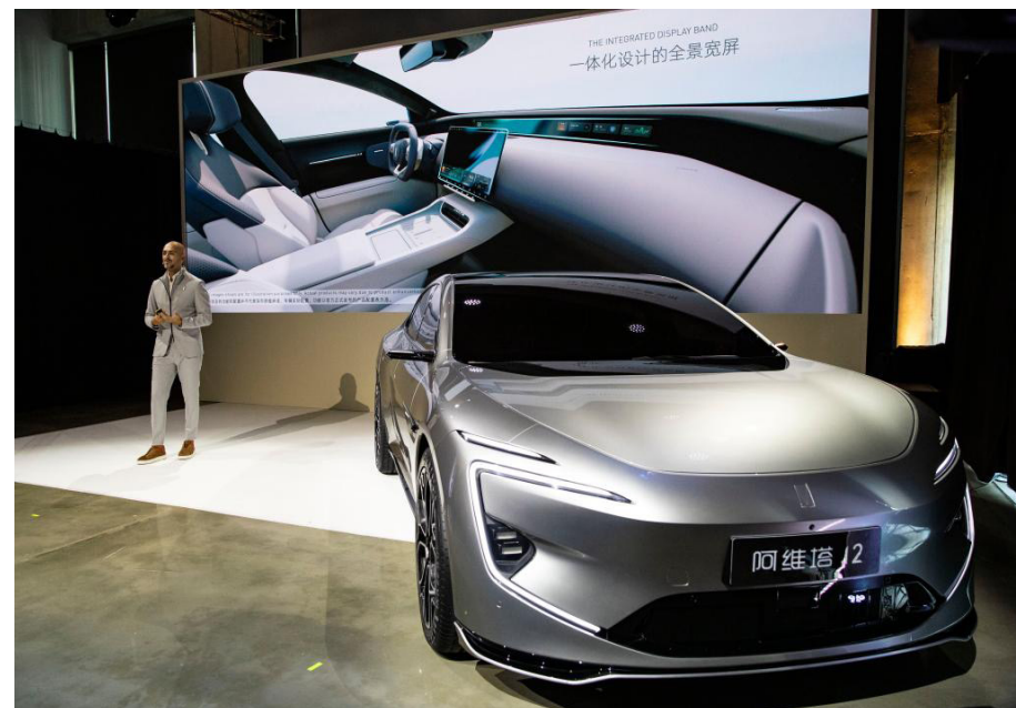
• The latest Chinese EV on display.