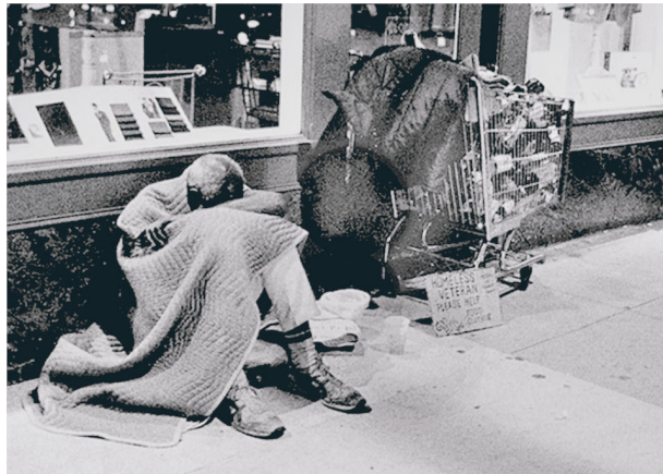
• This is America.

Worse still, only one of the drugs circulating in that country, fentanyl, killed more people than those three conflicts, since according to data from the Centers for Disease Control and Prevention and Health Statistics, by