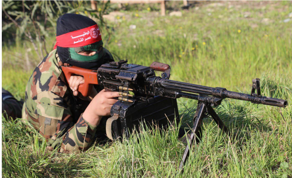
• DFLP Palestinian women's unit commando.

The insidious nature of bourgeois feminism cruelly perpetuates capitalist and imperialist systems, callously ignoring the struggles of colonised women and people. Today, Western colonial powers hypocritically cloak them-