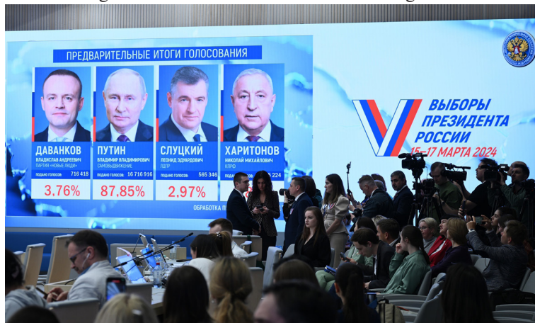
• Results coming in at the election commission in Moscow.

Chinese people should welcome and support Putin’s re-election, applaud Russia’s firm stance against the West, and strongly advocate for the continuation of the strategic partnership between China and Russia. We should also support China in making efforts to balance its relationship with the West regarding the Ukraine issue and maintaining overall strategic stability. This should be the mainstream perspective and framework of Chinese people’s understanding of the outside world.