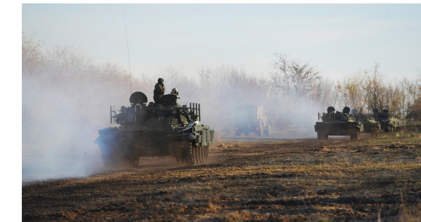
• Russian units advance.

“The most important and intense part of your work today of course is associated with the special military operation. The range of tasks here is the broadest,” Putin said. These range from the neutralisation of enemy agents, terrorists, and sabotage groups to “successful operations on the front lines and in the enemy’s rear” as well