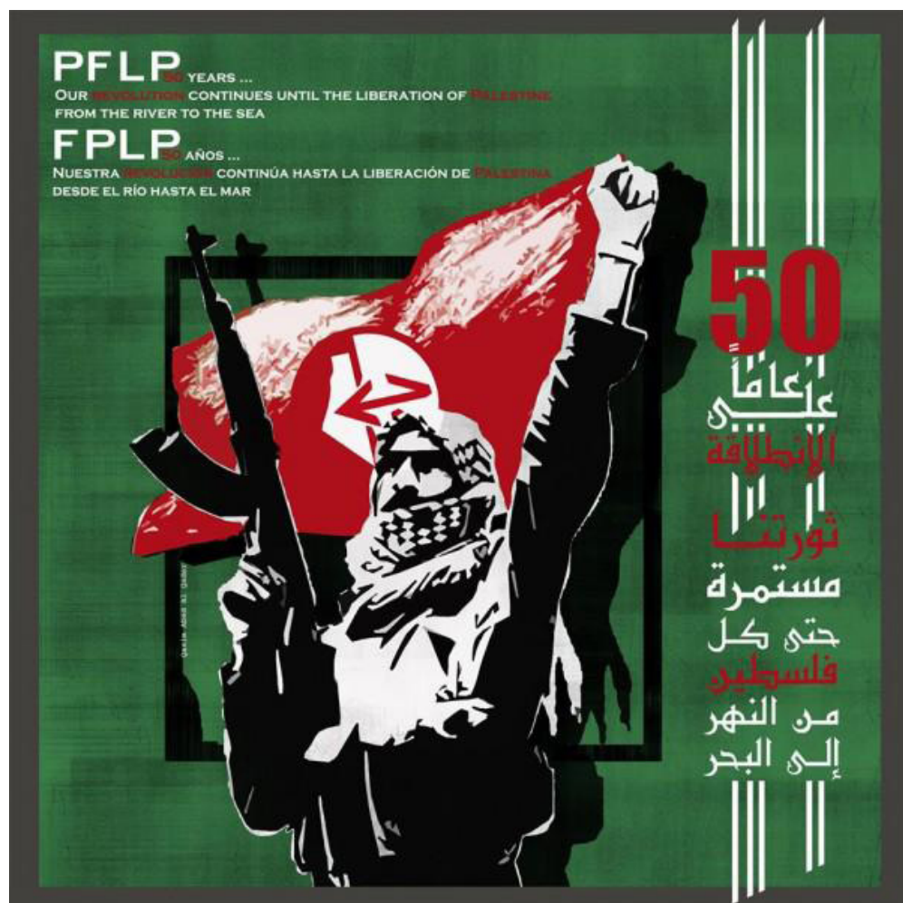
• Palestinian resistance.

Some 'socialists' even supported 'defence of the fatherland', wrongly identifying the interests of the working class with the national interests of the capitalist ruling class. In his 1915 essay The Defeat of One's Own Government in the Imperialist War Lenin takes to task those 'socialists' such as Karl Kautsky in Germany and Leon Trotsky in Russia who opposed the slogan of revolutionary defeatism, that is, the call for the defeat of one's own