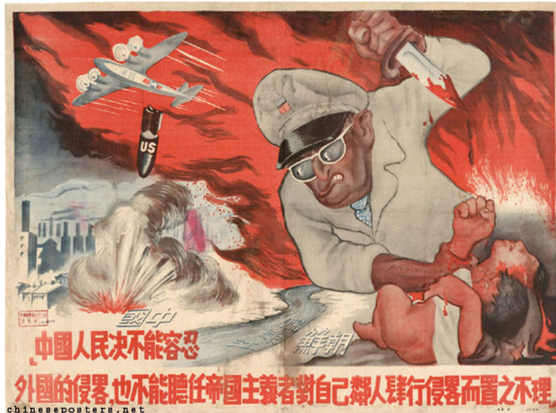
• The ugly face of American imperialism.