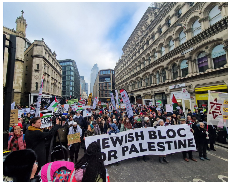
• Anti-Zionist Jews join the protest.

Square included former Labour leader Jeremy Corbyn and Sinn Féin President Mary Lou McDonald. McDonald called for an “immediate and permanent ceasefire” and said Sinn Féin had spent 25 years building peace, adding: