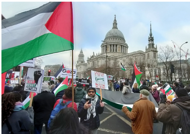
• Marching past St Paul's Cathedral.