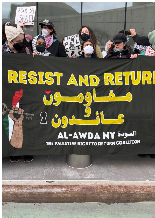
• Palestinian solidarity in New York.

For people of the Global South, the Zionist project is an anachronism of our times and has no future. The ‘Israeli exception’ must end. The oppressed Palestinian people, subject to terror but resisting this ‘last colonial project’, have acquired great symbolic value [for people who confront imperialism].