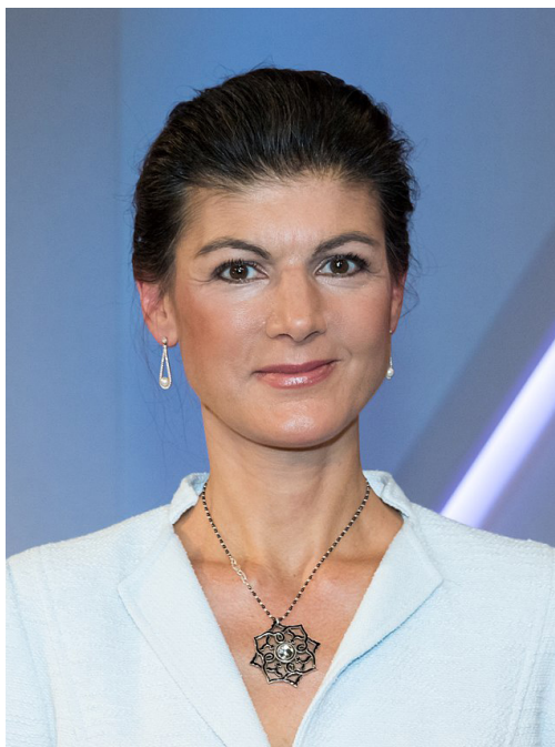
• Sahra Wagenknecht