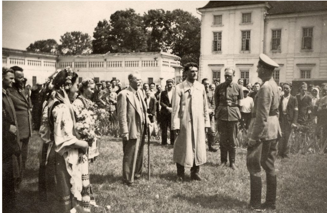
• 1941: Western Ukrainian collaborators welcome the Wehrmacht.

Yaroslav Hunka, Rota said, "is a Ukrainian hero, a Canadian hero, and we thank him for all his service". In unison, Zelensky, Trudeau, Deputy Prime Minister Chrystia Freeland, the leaders of the opposition parties, all the assembled MPs and Senators and the top brass of Canada's military, rose to their feet to give Hunka a standing ovation. He in turn