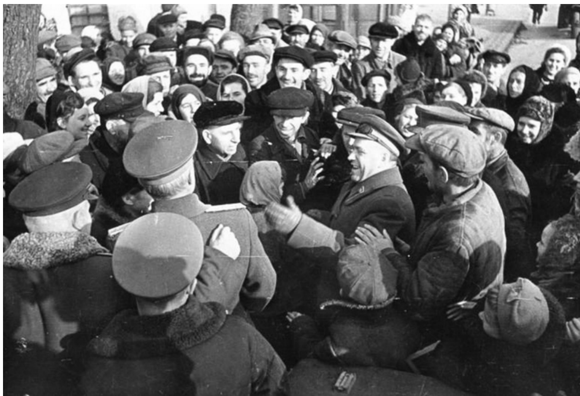
• 1944: Soviet Marshal Georgy Zhukov in liberated Kiev.

Even the mainstream Western media, which normally remains silent about NATO's support for and whitewashing of Ukrainian neo-Nazi groups amidst the conflict with Russia, has published article after article on the scandal, recognising it as a "PR disaster" for Trudeau and Zelensky.