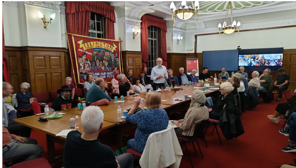
• Corbyn's moving address of thanks.

The event showed Corbyn in fine fighting spirit, a man enjoying mass support across all the communities in Islington, and who has lost none of his ability to lead and inspire all those fighting for a better and more just future for the working class in Britain.