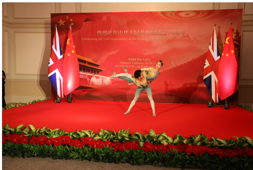
• Entertaining the guests.

During the reception a short film was screened showcasing China's economic and social achievements, and artistic troupes from the Guangzhou province in southern China staged a wonderful cultural performance.