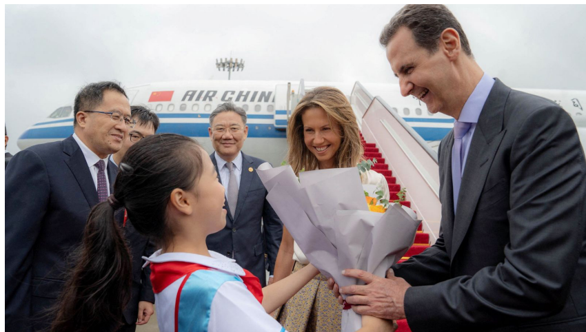
• A warm welcome for President Assad in Beijing.

The Syrian leader completed his first official visit