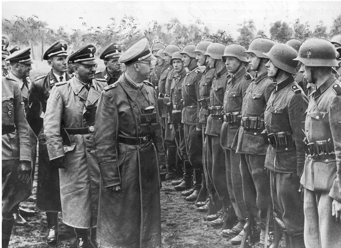
• Reichsführer Heinrich Himmler inspects a unit of the Waffen SS Galicia.

After the escalation of the Ukrainian crisis in early 2022, Freeland, now deputy prime minister, got into more trouble after tweeting (and after