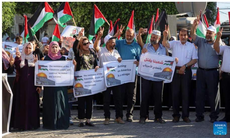
• Palestinians in Gaza protest against US President Joe Biden's visit to Israel last year.