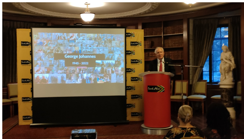
• Peter Hain speaking.