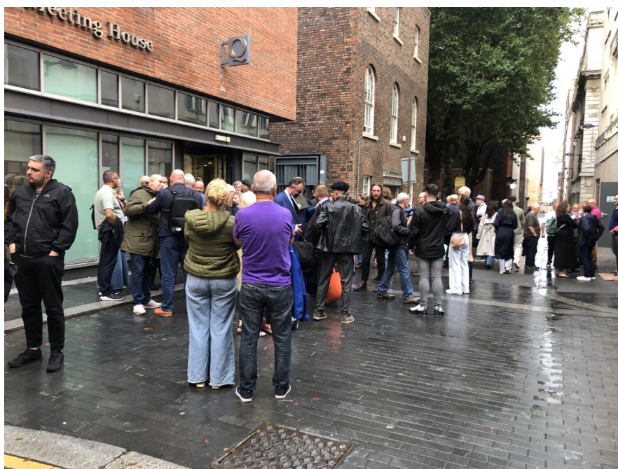
• The motley crew outside Friends House after the fire alarm went off.

We must continue to politically campaign against this left posturing and to condemn pro-imperialist positions especially in the trade union movement that achieve nothing but sow confusion and disinformation. To fight against those who unashamedly support Zelensky's fascist regime. To demand an end to the billions spent in military and financial support while the working class in Britain suffers. To support proposals for a just and lasting peace in Ukraine that restores democracy to all the people of Ukraine and recognises the rights of the Crimean and Donbas republics to join the Russian Federation.