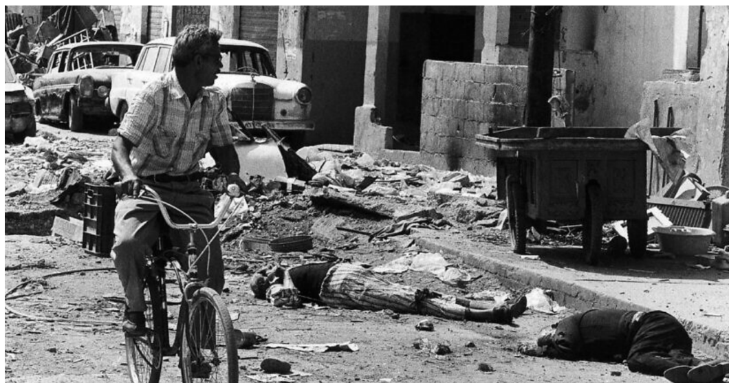
• The horror of Sabra and Shatila.

The author is a member of the international criminal court bar association and the Democratic Front for the Liberation of Palestine (DFLP)