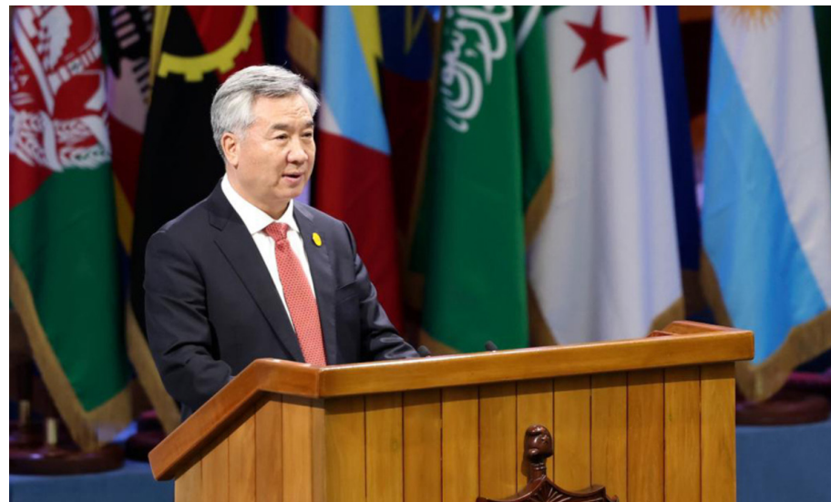
• Li Xi, a member of the Political Bureau of the Communist Party of China, speaks at the G77 Summit.

As the capital of the voices of the South, in Havana the G77+China reinforced the need to create co-ordination strategies to fight against imperialist forms of domination. They made clear their rejection of the imposition of laws and regulations with extra-territorial impact and coercive economic measures,