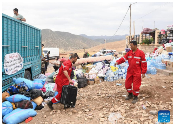
• Rescue workers taking supplies to the victims