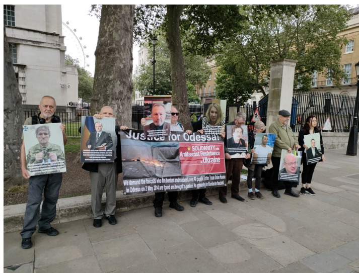
• Free Ukraine's political prisoners. International Ukraine Anti-Fascist Solidarity (IUAFS) protest in Whitehall last month.

Whether that happens is another matter. And nothing is likely to happen in the near future if the Jeddah 'peace conference' is anything to go by. Although Brazil, China, India, South Africa and Turkey sent