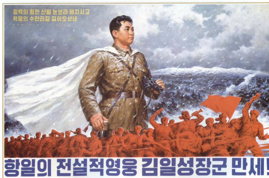
• Kim Il Sung leads the Korean people to victory

As we said in the invitation to participate in this seminar, on 25 th June 1950 the US imperialists, under the aegis of the United Nations, had launched a brutal illegal war of aggression against the Korean nation. Since 27 th July 1953, the USA has