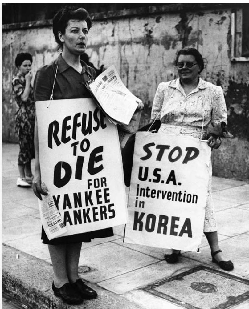
• British communists protest against the war

Unite in Favour of Peace and Independence!