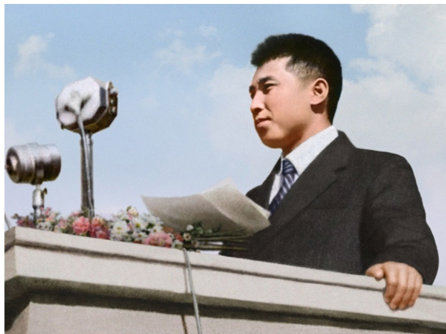
• Kim Il Sung led the Korean people to victory

For the people in Britain, it is crucial that the demand be made that Britain make amends for its role in the crimes perpetrated against the Korean people during the Korean War. Furthermore, Britain must immediately end its participation in the illegal naval embargo against the DPRK, which is part of the US-led sanctions regime and an act of war and a crime against the peace, the most serious war crime under international law. Friends of Korea will itself do its work to hold the USA responsible for its crimes on the Korean Peninsula before, during and since the Korean War, and demand that it sign a peace treaty with the DPRK to end the Korean War. For the people, this is a matter of contributing to making sure that