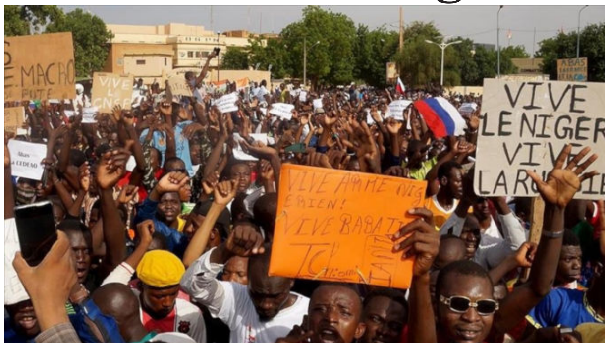
• Street support for the army and the Russians in Niger.

Niger is a target of imperialism for many reasons. Its natural resources include uranium, which supplies up to one-third of France's entire electrical grid. Yet Niger remains one of the poorest countries in the world, with the majority of its over 27 million people lacking access to