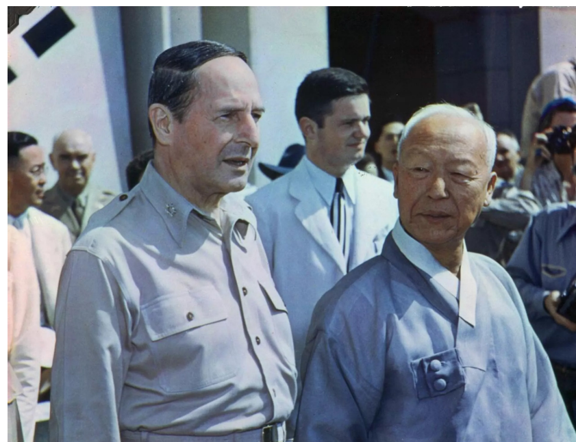
• Syngman Rhee with his master, US General McArthur

Since 27 th July, 1953, the USA has done everything possible to maintain its military presence in Korea and keep the Korean War going. On 1 st October, 1953, it concluded the US-