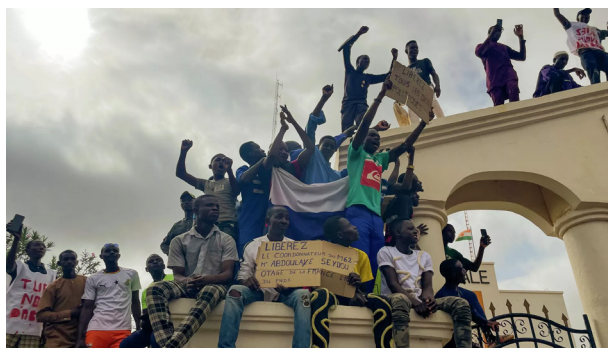
• Support for the coup on the streets of Niger.

France was the coloniser of the West African country until the nation's independence in 1960. Since independence, France has maintained its military presence and it has 1,500 soldiers currently deployed in Niger. The USA also has troops stationed in Niger.