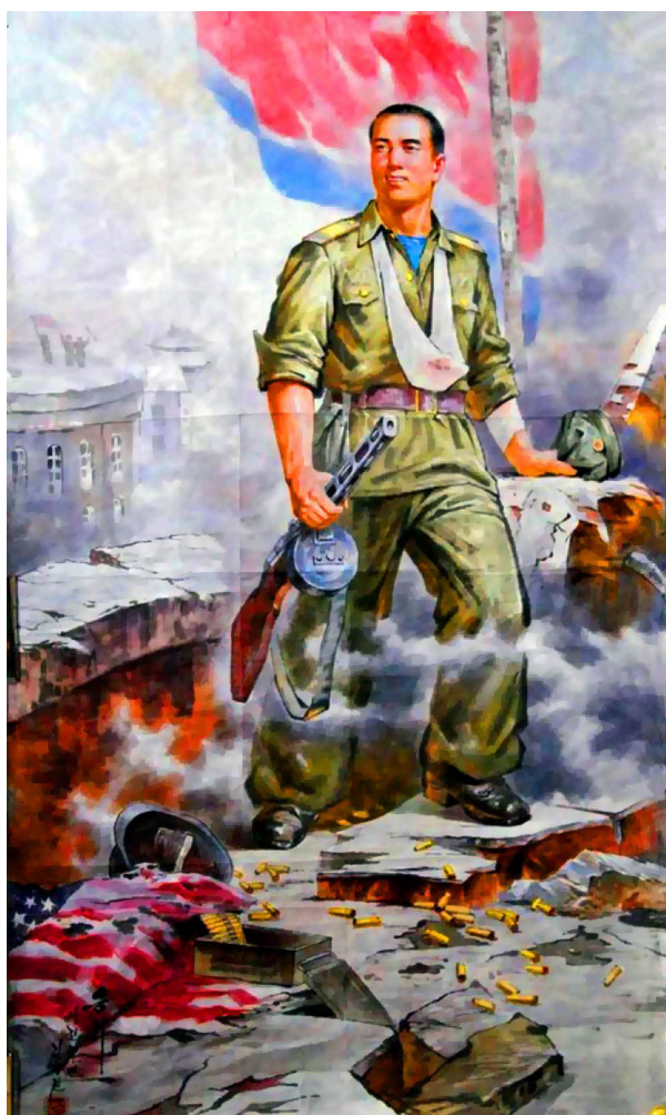
• Korean People's Army liberates Seoul

The aim of the USA remains the same today as it was at the end of the Second World War – to occupy the entire Korean Peninsula as a launching pad for its takeover of Asia and then the world. And the US justification for doing so remains as bankrupt as ever. All the attempts of the USA to realise its domination of the region – its occupation of the Korean Peninsula with almost 30,000 troops and its military bases, the ongoing attempts to sabotage the Korean people's movement for national reunification,