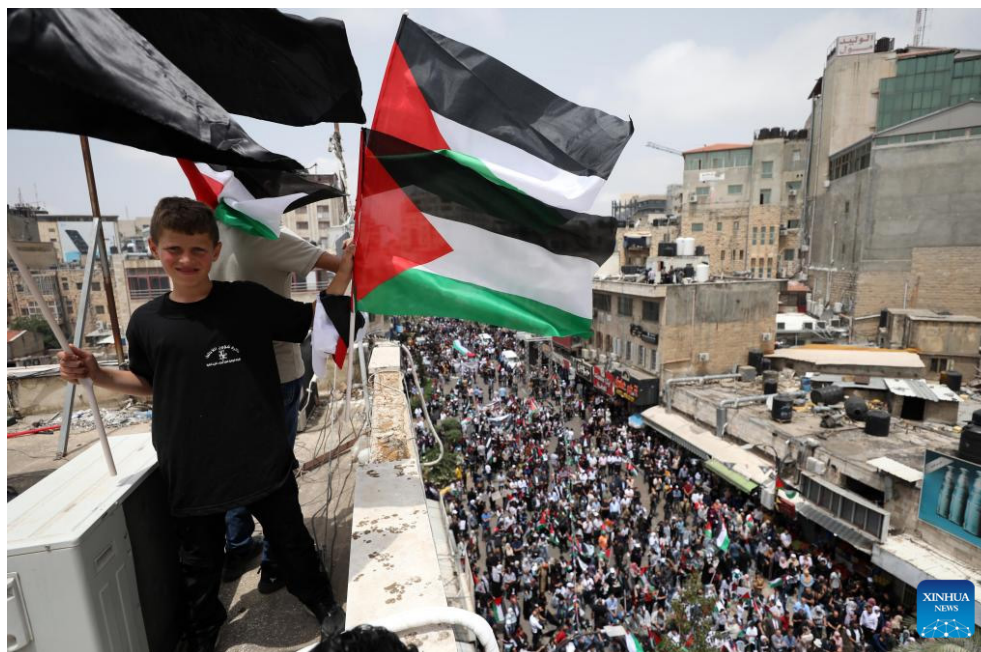
• Steadfastness in Gaza

The racism and extremism of the Israeli government is leading to a wider conflict in the region, however. The illegal settlement projects, the ethnic cleansing and the killing of Palestinians could ignite the Middle East with a war with unimaginable consequences.