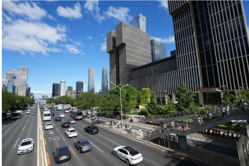
• Beijing – city of the future

This voice of the Washington establishment explained: "For Yellen, it is obvious that America is entitled to define its national security at a planetary level."