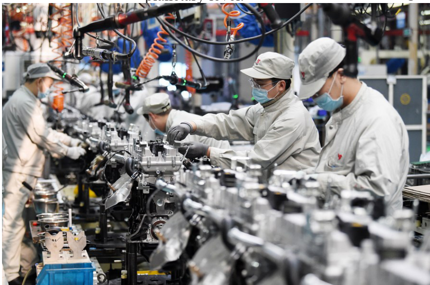
• China – the workshop of the world

Essentially, Yellen's thinly veiled threats, and the demand that China change its econom-