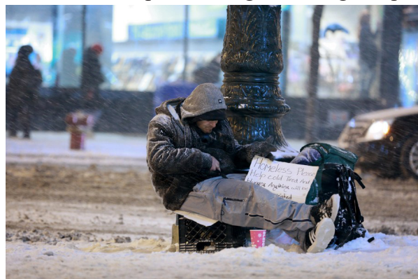
• street life in Chicago