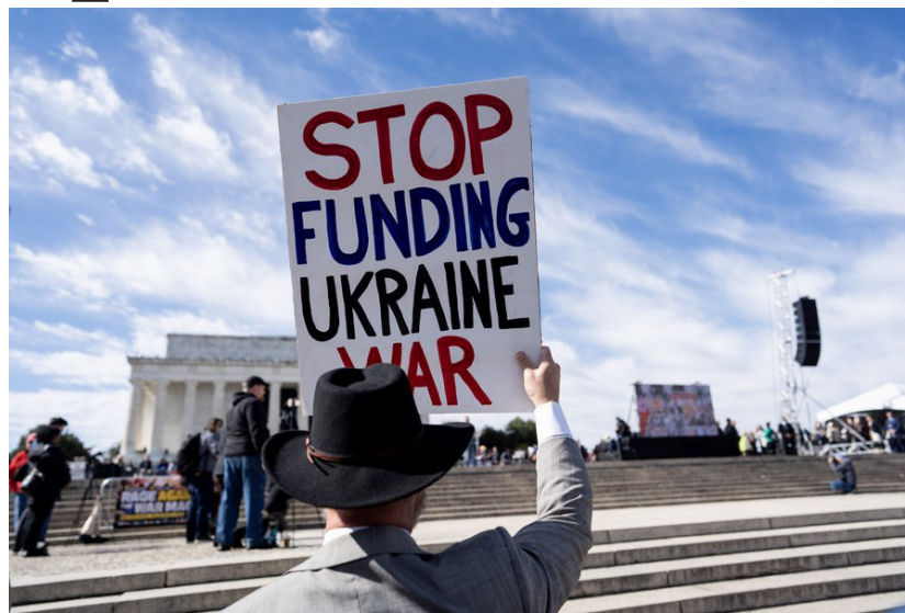
• Anti-war protest in Washington

The 12-mile-long Crimean Bridge is Europe’s longest and it is a key supply route for Russian forces on the