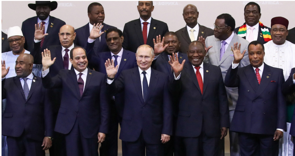
• Vladimir Putin with African leaders at the conference