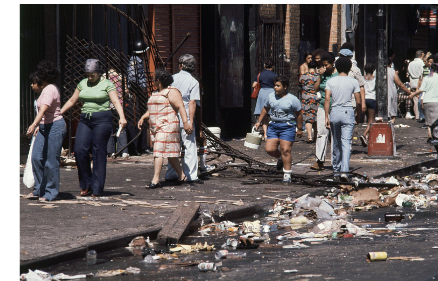
• on the streets of New York

China's state-owned industries are shielded from foreign competition and receive government subsidies. This has angered foreign corpo-