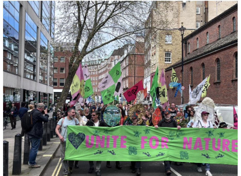
Bianca Jagger, and indie band She Drew The Gun . The long weekend of

They were joined by household names such as top film actor Juliet Stevenson, White Teeth author Zadie Smith, legendary producer and composer Brian Eno, human rights advocate