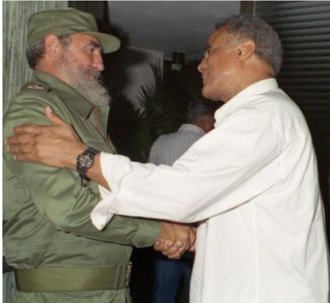
Fidel and Harry

in New York’s borough of Manhattan but spent his early childhood in his family’s native Jamaica. Handsome and suave, he came to be known as the “King of Calypso” early in his career.