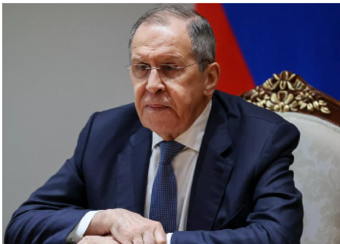
• Sergei Lavrov

denounced the UK for "absolute recklessness, irresponsibility and impunity" in supplying these DU shells to the Zelensky regime that, they say, are likely to "cause irreparable harm" to the health of Ukrainians and inflict "tremendous economic damage to the agro-industrial complex" in the region.