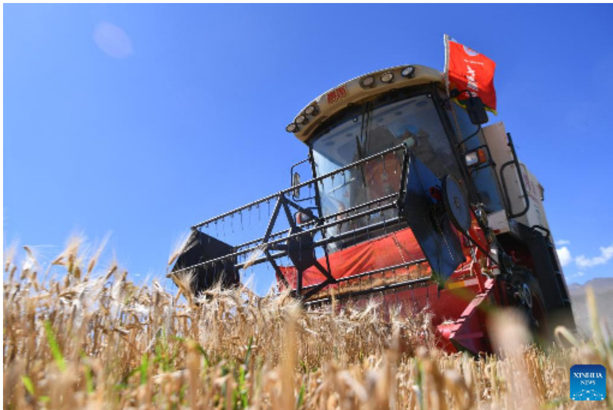
After the revolution: A new life for Tibetans

In 2008, for instance, he used his influence to instigate violence and secessionist activities in the region. The tragedy that occurred in Lhasa on 14 th March 2008 saw a dozen innocent locals either immolated, beheaded or asphyxiated, and police on patrol were assaulted. On the very