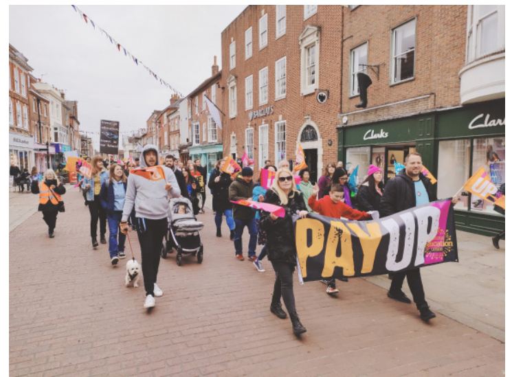
by New Worker correspondent

Although it is easy for to make a left-wing critique of USDAW, we should not forget that that retail is a very difficult sector to organise. More than most unions, it has a sudden influx of members when stores are closing. Shelf-stacking does not take long to master, which means discontented workers are easy to replace.