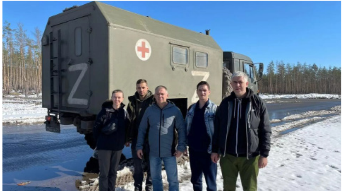
• Gurkin team -- saving lives in the Donbas

He saw many patients at that time. "We often provided