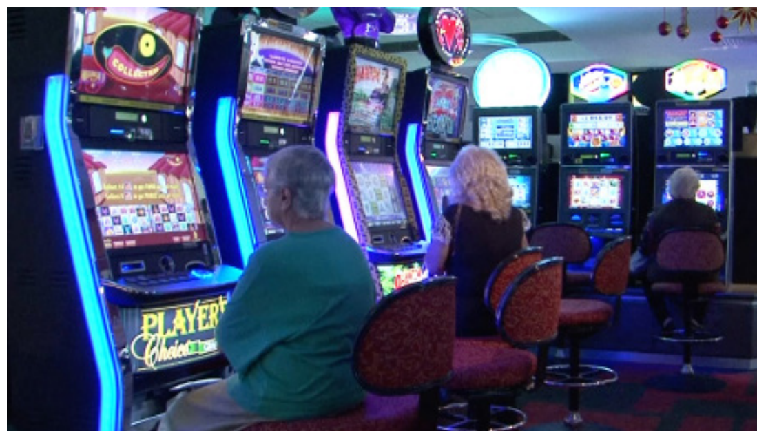
• All that glitters is not gold...