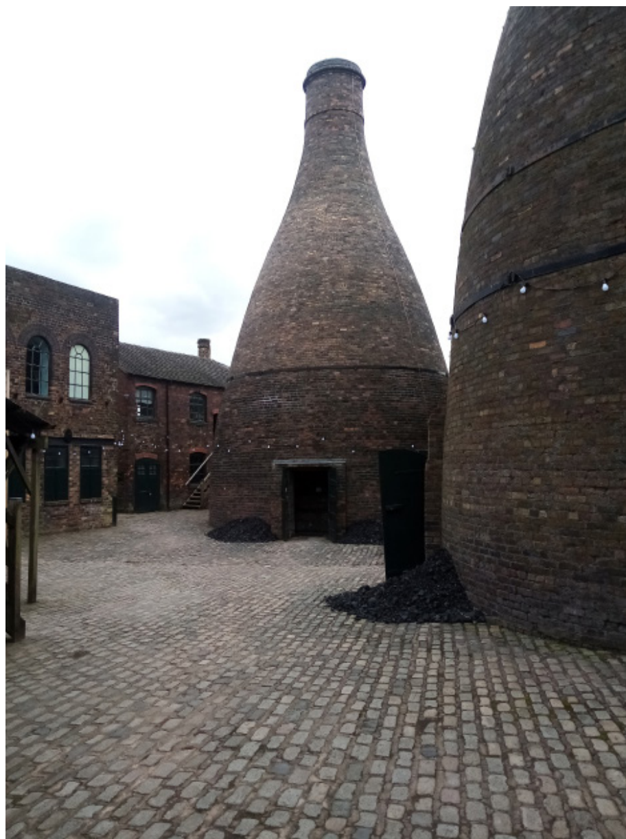
• A bottle kiln from the old days

Football fans will come to see the once mighty Stoke City play in its new stadium where the ashes of their