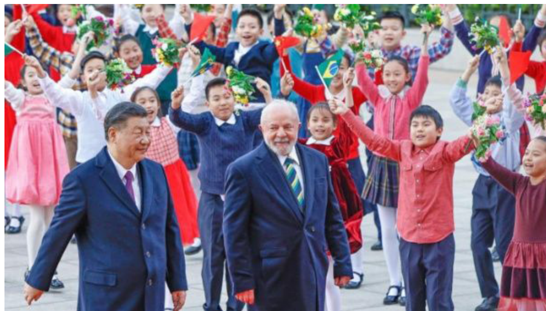
• A warm welcome in Beijing. Lula and Xi Jinping.

The only 'peace plan' the Americans have got to offer is a ludicrous demand for Russia's unconditional withdrawal from Crimea and the Donbas and the prosecution of Vladimir Putin as a "war criminal". Although their chief Ukrainian lackey, Vladimir Zelensky, likes to pose as an heroic war-leader in the West, in his own country more and more people are voting with their feet – fleeing abroad to avoid conscription or deserting to avoid the senseless sacrifice on the front. The Belarus leader Alexander Lukashenko says that according to "insider information", people on both