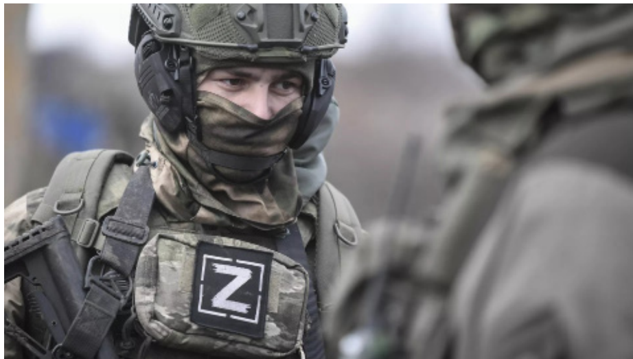
• on the front

It is not the leak that is the most surprising aspect about the classified documents however, but how deeply the USA is involved in the conflict and how much it is doing to help Ukraine. Despite its denial of direct involvement, the USA is already a de facto participant in the conflict,