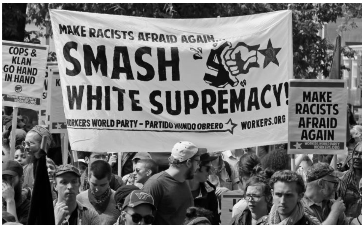
• protests on the streets of America

Trump said there were "very fine people on both sides", even though that same white-supremacist